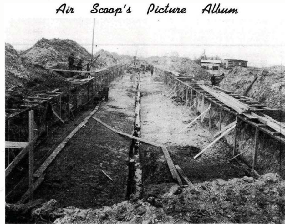
The above picture, taken back in March 1930, shows the early stages of the construction of the NACA's towing Tank. The picture was taken looking North.

FOR SALE: Kenmore washing machine. Sandra Yoakum, 2352.