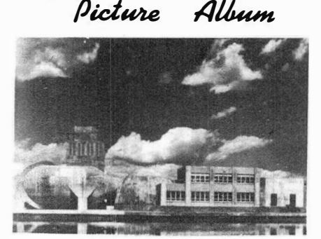
8-Foot High Speed Tunnel

The program is open to the public and no admission will be charged_