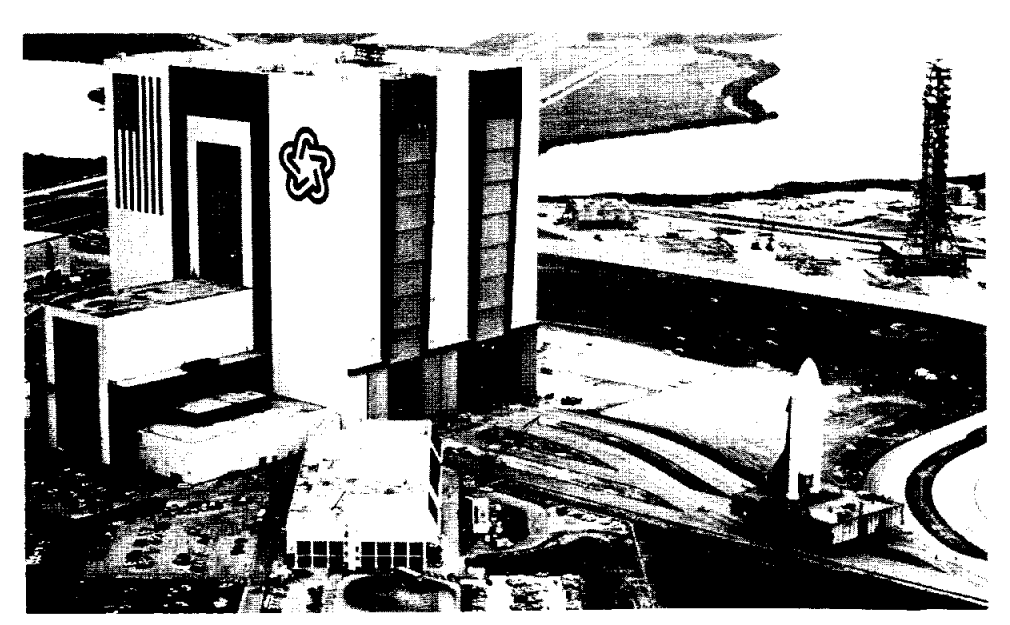
Enterprise roll-out at the Cape

The three engines for the first orbital flight should be delivered to the Cape in the May/June time frame.