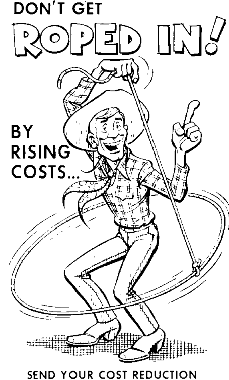
SEND YOUR COST REDUCTION REPORT ON A JSC 1150 FORM COST REDUCTION OFFICE NOW!

FRIDAY: Seafood Gumbo; Fried Shrimp; Deviled Crabs; Ham Steak; Salisbury Steak (Special); Buttered Carrots; Green Beans; June Peas.