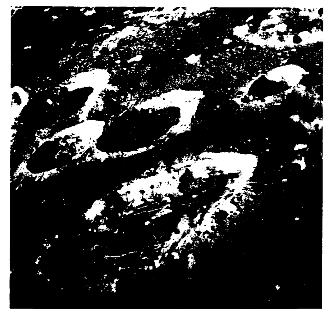
A NICE PLACE TO VISIT, BUT . . . — The surface of the moon was described as a stark, hostile, forbidding place by the Apollo VIII crew. The large crater in foreground is Goelenius (10° SLat x 45° ELong), with Magelhaens, Magelhaens A and Colombo A clustered at upper left. At upper right is Gutenberg D.