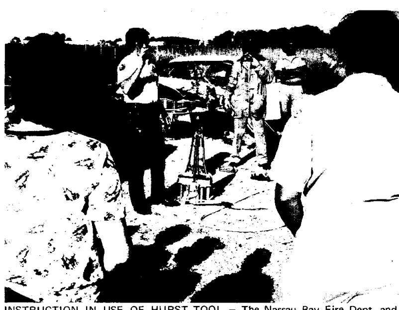
INSTRUCTION IN USE OF HURST TOOL - The Nassau Bay Fire Dept. and other Clear Lake units joined in this demonstration and lesson in the use of the Hurst tool Saturday. Notice the car in the background used in the demonstration.