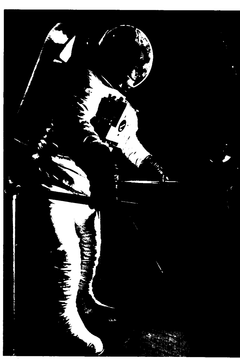
SHUTTLE SPACESUIT - Side lighting and dark shadows make an interesting photograph in this demonstration of Hamilton Standard's proposed spacesuit for use by Orbiter crews. The contract provides for the suits to be produced in sizes small, medium and large for use by either men or women.

The cost-plus-award-fee contract is valued at about $46,550,000 with the period of performance from July 1, 1976, through Sept. 30, 1978.