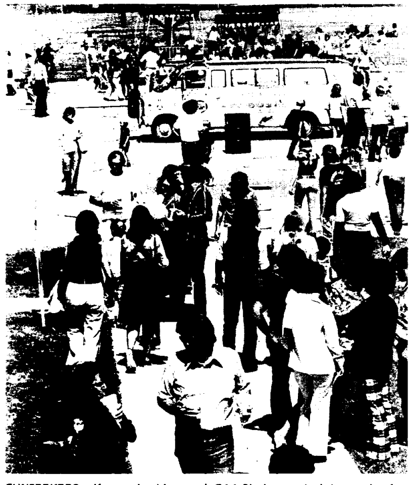
FUNSEEKERS - If you missed last year's EAA Picnic, you don't know what fun was had by all these people and more. Don't be left out again this year. Get your tickets now for the Oct. 16 Spirit of '76 Picnic. They are available at the Bldg. 11 Exchange Store or from your EAA representative.

All that can be said to those looking forward to the pecan harvest is, "wait until next year."