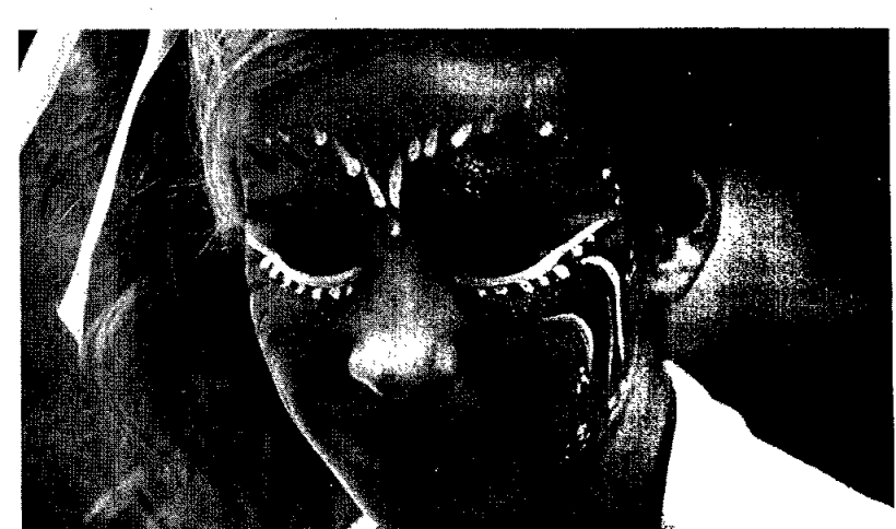
PICNIC PAINT—One of the many fashion conscious youngsters at the "Back to the Future" JSC Picnic shows off her illustrated face. The picnic was May 7 at the Gilruth Recreation Center.

Applications can be obtained by writing to the Astronaut Selection Office, Mail Code AHX.