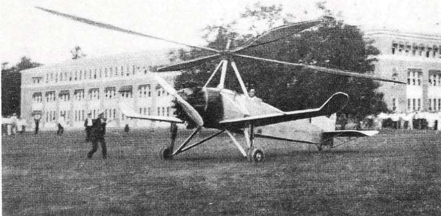
Shown above is the first Autogiro to fly in America. The picture was taken when the plane arrived at the National Museum in 1931.