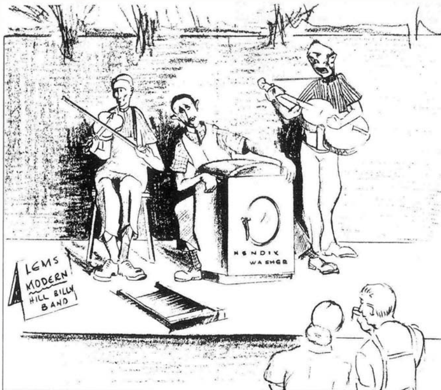
"Lem's new-fangled wash board may look purty, but it don't sound as good as the old one."

Now remember the dates, June 11 and 12, and buy your tickets from your Morale Activities Association Representative.