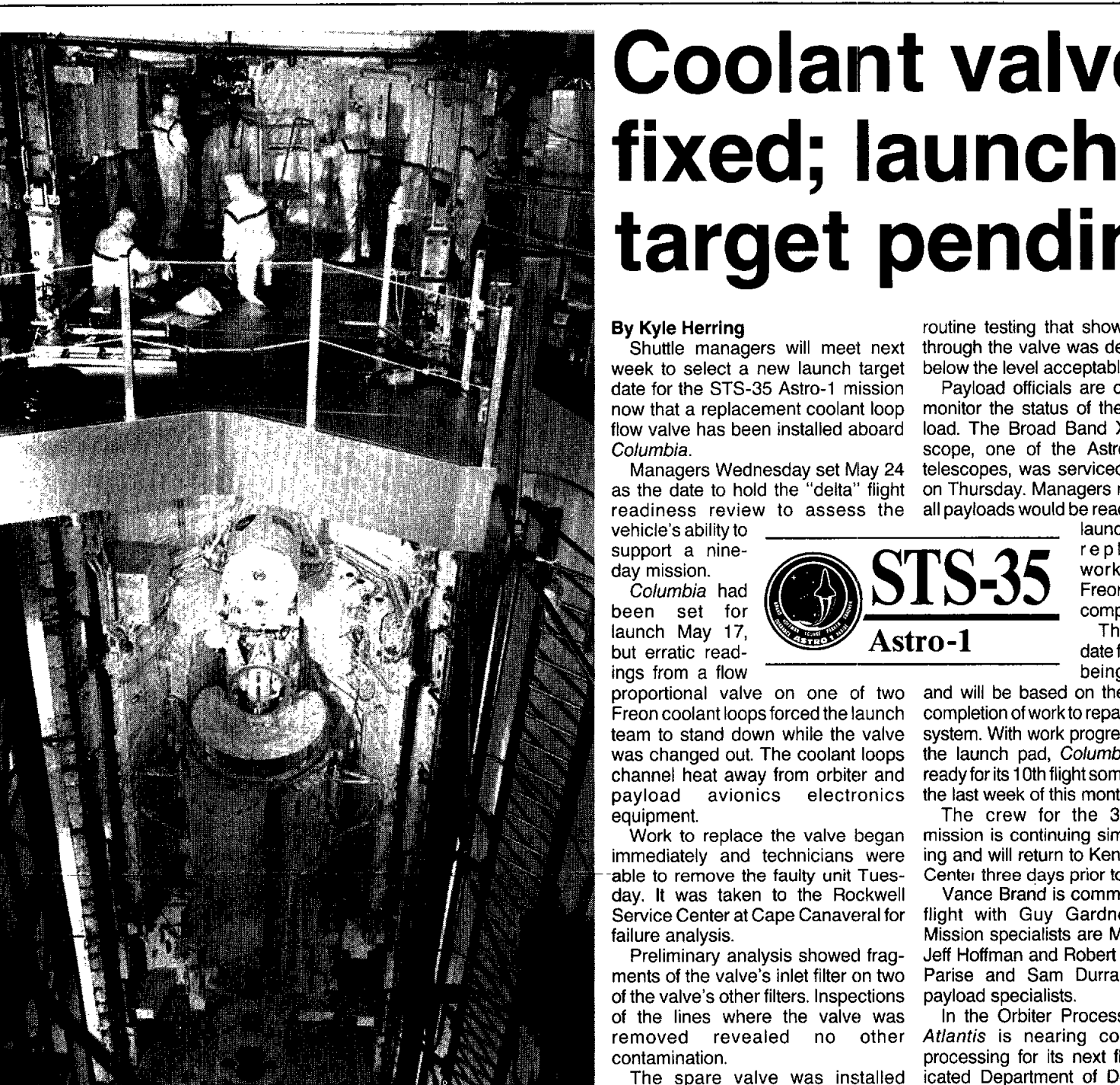
Kennedy Space Center workers change out a flow proportional valve on Columbia's Freon coolant loop. They worked directly over Astro-1 in the payload bay, replacing the difficult-to-reach valve on the pad for the first time.

In the Orbiter Processing Facility, Atlantis is nearing completion of processing for its next flight, a dedicated Department of Defense mission. The orbiter is scheduled for transfer to the Vehicle Assembly Building June 3 or 4 to be mated to its external tank and solid rocket boosters. Launch of the STS-38 mission is scheduled for July 9.