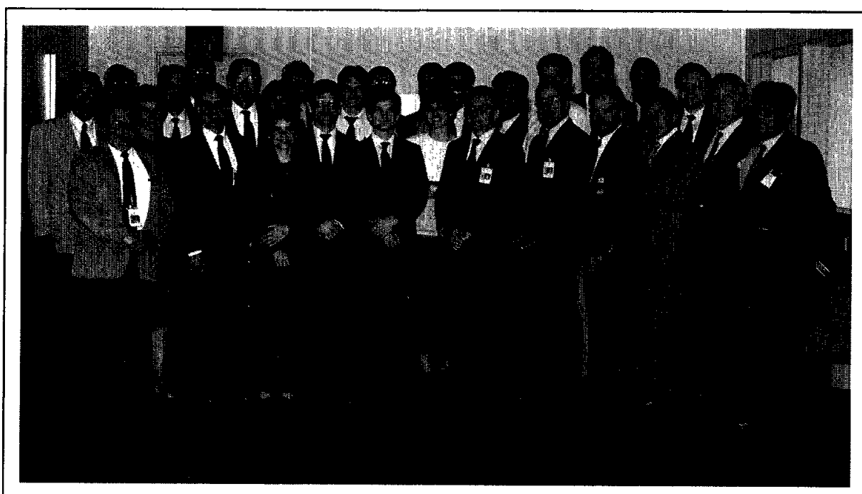
The group of patent holders honored at the JSC Inventors Luncheon is getting larger every year. This year's group is comprised of 40 inventors.