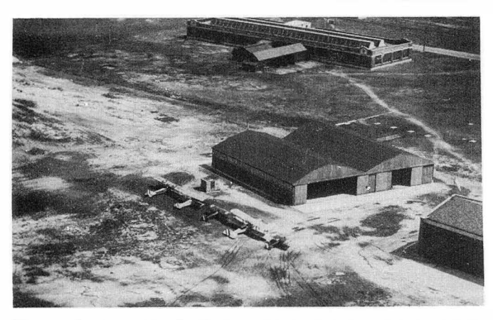
Shown above on the left is a picture taken of the NACA Hangar and airplanes back in March, 1924. The building shown in the hackground was not a part of the NACA but

LOST: Maroon Eversharp fountain pen. Felieved to have been left on shuttle bus. Call 4431.