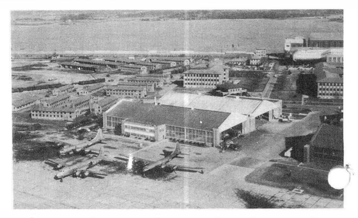
belonged to the Army. The up-to-date picture on the right shows the vast contrast and the great changes that have taken place within the past 23 years.