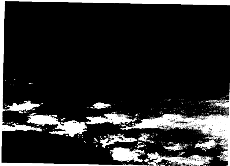
MOON CLOUDS over the Western Pacific-Gemini 7

Come climb into my spaceship! Up there it will be glorious! Here on the old earth, It is now much too small for us.