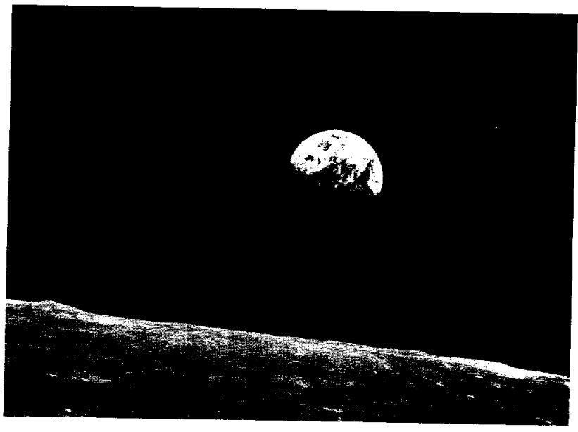
Earthrise over the lunar horizon-Apollo 8

The once-thought highly impossible dream Of reaching the moon was by satellite seen And voices heard for all to know Apollo Eleven premiered "the moon show." In nineteen hundred and sixty-nine July the twentieth, the scheduled time The lunar module, Eagle, came to rest On the Sea of Tranquility, a fact to be blessed. Bravely Neil A. Armstrong descended with purpose And was first to touch the moon's surface.