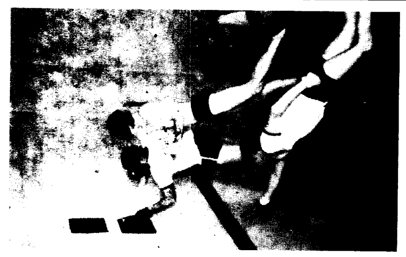
UNDERWATER ACTION—Members of the championship MSC Lunarfins Club compete with members of the Houston Underwater Club for possession of the hockey puck during recent matches at Lee College in Baytown.