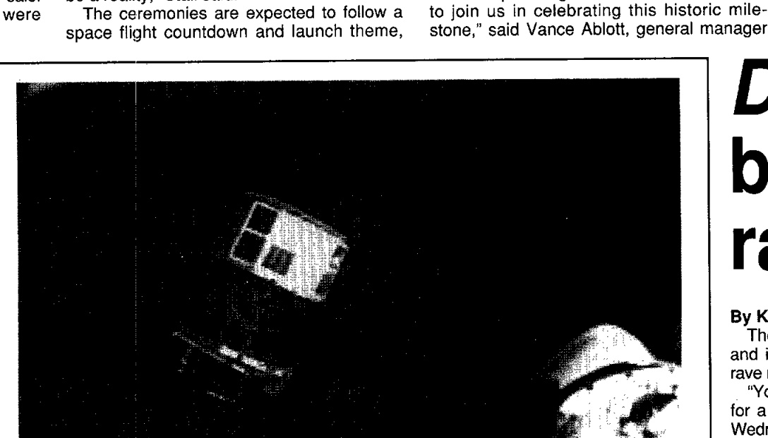
The first of three Chemical Release Observation canisters leaves Discovery's payload bay at 8:30 p.m. Wednesday. Cameras on the Infrared Background Signature Survey Satellite, deployed Wednesday, will train on clouds of rocket fuel that will be released from the canisters.

The 9:30 a.m. fire was quickly extinguished by on-site personnel with insignificant damage to the air-