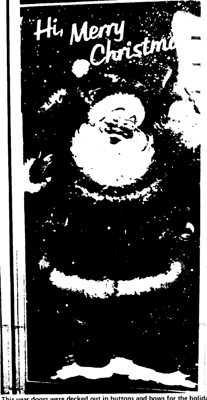
This year doors were decked out in buttons and bows for the holidays.