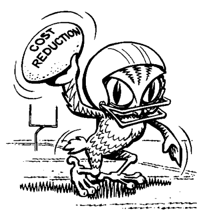
Report the results to BH-4, on JSC form 1150, Cost Reduction Office