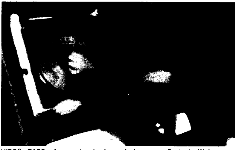
VIDEO TAPE—An overhead view of Astronaut Paul J. Weitz at the video tape recorder in the Orbital Workshop of the Skylab one - two space station cluster in Earth orbit. Weitz is changing the tape in the recorder and storing the used data tape.