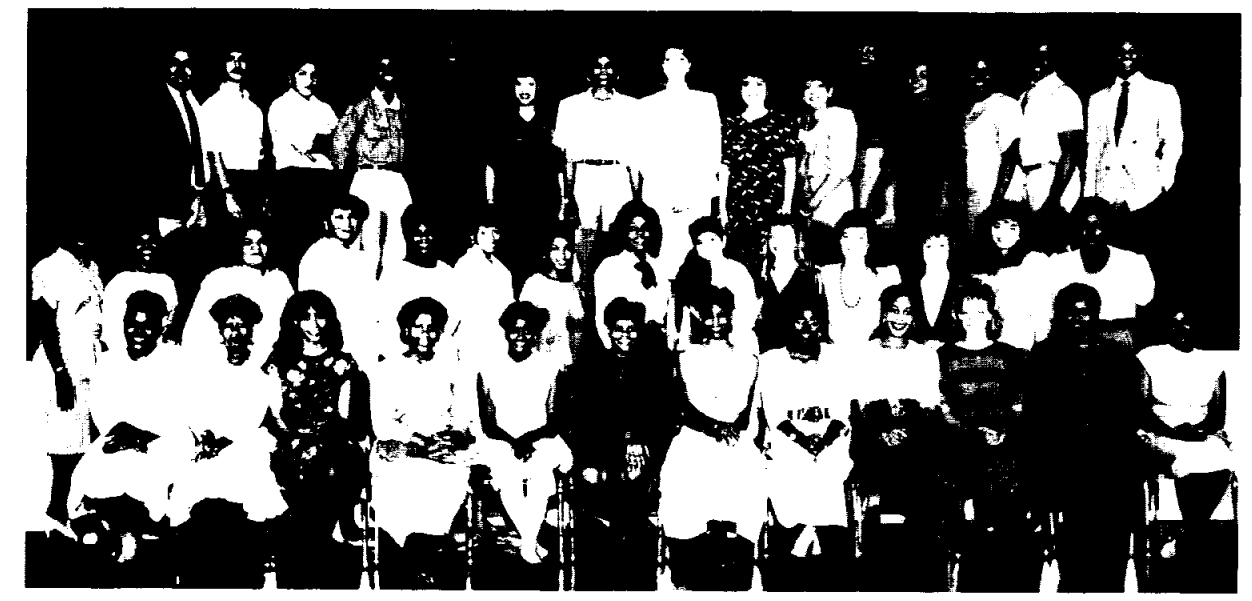
This year, the JSC Office Education Program presented graduation certificates to 52 area high school students during a ceremony at the Gilruth Recreation Center June 28.