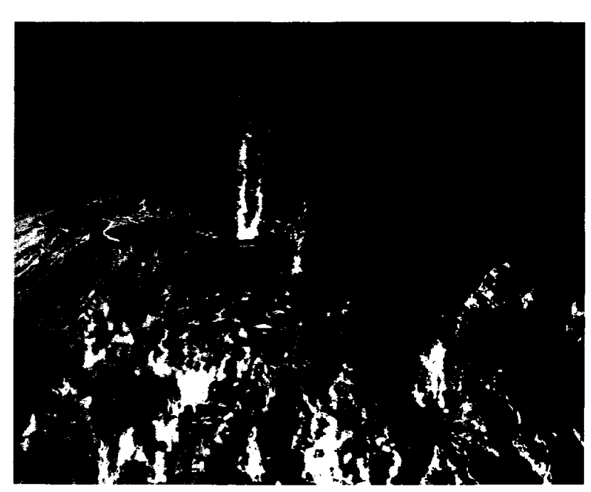
Venus: did it once have oceans?

• Because of the evidence for past oceans, scientists are not ruling out the possibility that some forms of life once existed on Venus. But they also believe that when the runaway greenhouse effect of the Venusian atmosphere began, it wiped out most existing phenomena on the planet, including the oceans, and replaced them with today's furnace-like environ-