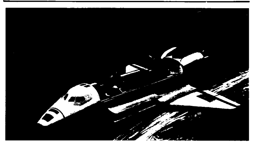
SATELLITE LAUNCHERS - This artist's concept shows two Delta Class and one Atlas/Centaur Class Spinning Solid Upper Stages (SSUS's) in launch configuration with satellites attached in the cargo bay of a Space Shuttle Orbiter. The SSUS will be a more economical vehicle for delivering satellites from the Orbiter's low Earth orbit to their required transfer orbits, such as missions to geosynchronous positions.