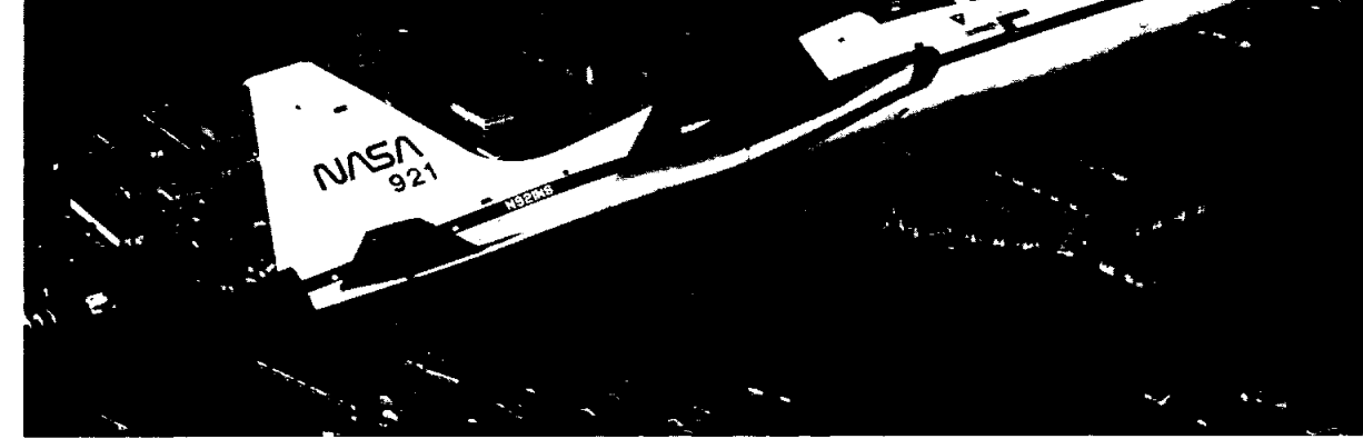
A T-38 Talon in flight.

They were about 10 miles out over the Pacific on the northbound leg of their approach. Rivers, who