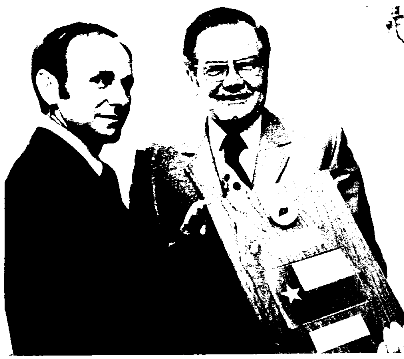
PRESENTING PLAQUE-Astronaut Alan Bean presents Texas Governor Dolph Briscoe a plaque containing a fragment of a rock from the Taurus Littrow Valley of the Moon and a Texas Flag which was carried to the Moon aboard spacecraft America during Apollo XV11. The presentation took place at the Hyatt Regency during the Governor's recent visit to Houston.

. NASA biologists at Ames Research Center discovered the Souza—immersed the bacteria in rod-shaped bacteria—nameless as vet—in an alkaline spring in northern California