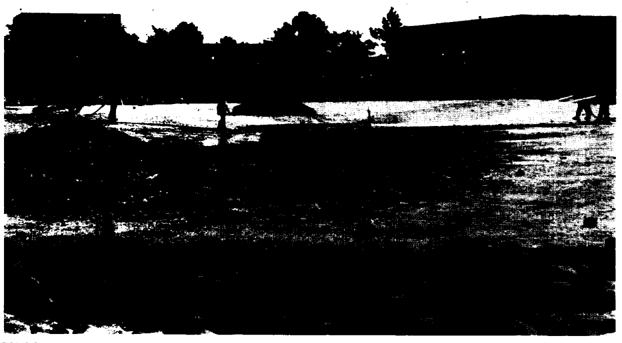
POND CLEANING TIME — In the photo above, employees are busy cleaning one of the ponds at JSC. The ponds contribute significantly

In view of the inherent complexities associated with materials processing and understanding, there has been not the slightest doubt in my mind and in the minds of many of my colleagues across the nation that outer space would add a new dimension to materials science and engineering. The Skylab mission has certainly marked a sound starting point," Gatos stated