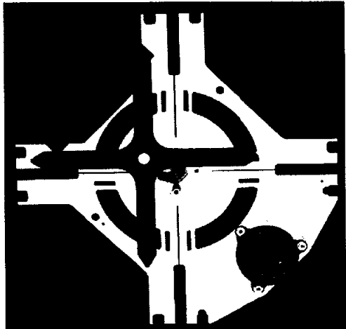
Top: Greg Lange sits at the command console in a mockup of the Russian Mir space station during a visit to that country's space program facilities. Left: The JSC team that developed and fabricated a target for an upcoming shuttle-Mir docking mission stands behind its work. Above: The 14-inch-wide target includes a stand-off cross that protrudes 12 inches.