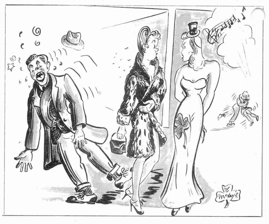
"But you said wear any little old thing, just so it's green."