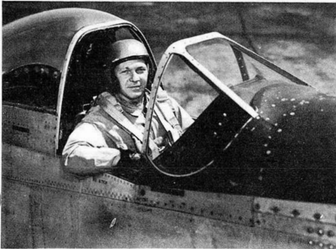
Herbert H. Hoover