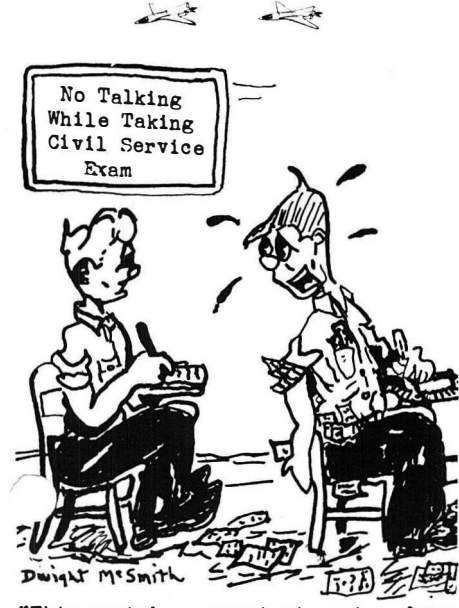
"This must be a new test, not a darn one of my clues seem to work."

Teams entered in the league are as follows: 7 X 10 Foot Wind Tunnels; 8 3/4 Tunnels; 19-Foot Presure Tunnel, Pilotless Aircraft Research, Engineering Service Division, 16-Foot Tunnel, Instrument Research, Electrical Shop, Physical Research, Dynamic Tunnels, West and East Model Shops, Loads, Low Turbulence, Structures, and Full Scale Tunnel.