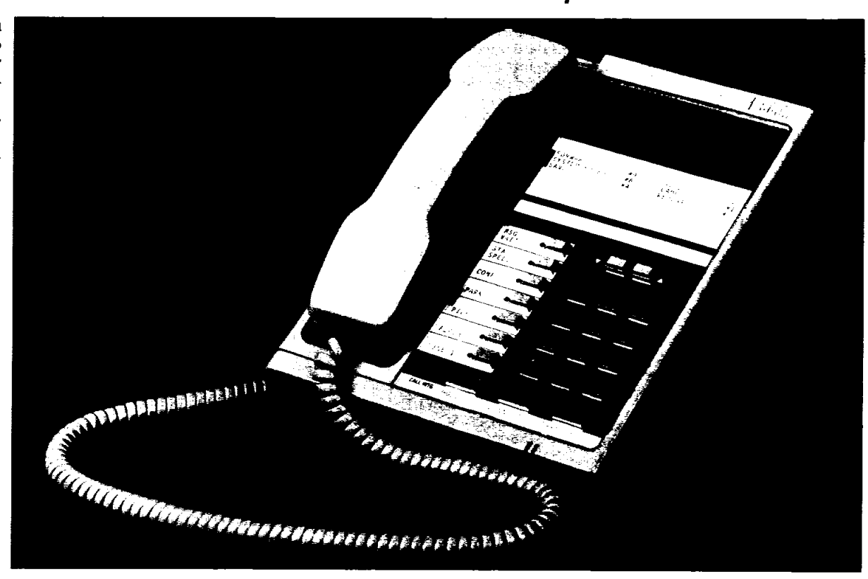
The ROLMphone 120, above, the standard instrument in the new phone system, will be used by most employees. Below, the ROLMphone family features, from left to right, the 120, the 400 and the 240.

Call Forwarding—To forward calls to another office, the user simply presses the FWD button, followed by the 5-digit onsite extension number where the calls should be forwarded. To cancel a forwarding command, the user presses the FWD button from the forwarded extension.