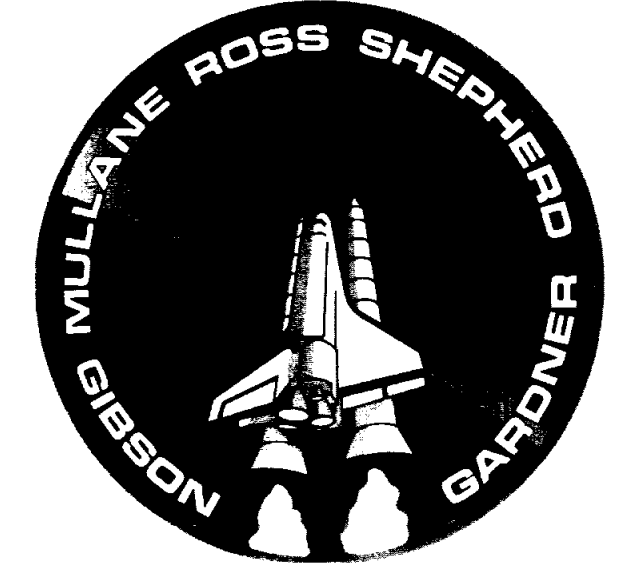
STS 27 PATCH DESIGNED—The official insignia of mission STS-27 depicts a Shuttle liftoff backed by a rainbow, signifying the nation's return to flight, and by seven stars, commemorating the Challenger crew. All STS-27 crewmenbers, whose names outline the patch, contributed to the design.