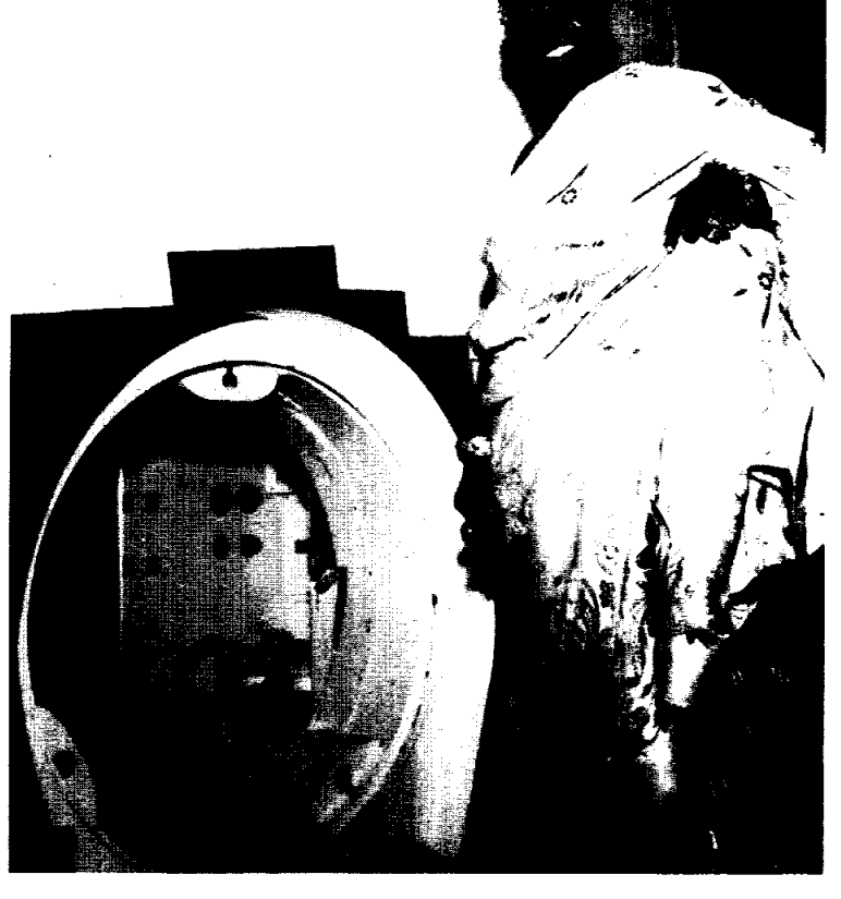
Osabarima Nana Kodwo Mbra V, a reigning monarch in Ghana, West Africa, toured the Space Shuttle mock-up and training facility and the Mission Control Center during a visit last week.

The Senate measure also funds the Veteran's Administration and the EPA's "Superfund" program.