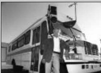
JSC transportation lead keep vehicles rolling to support special events, visits.