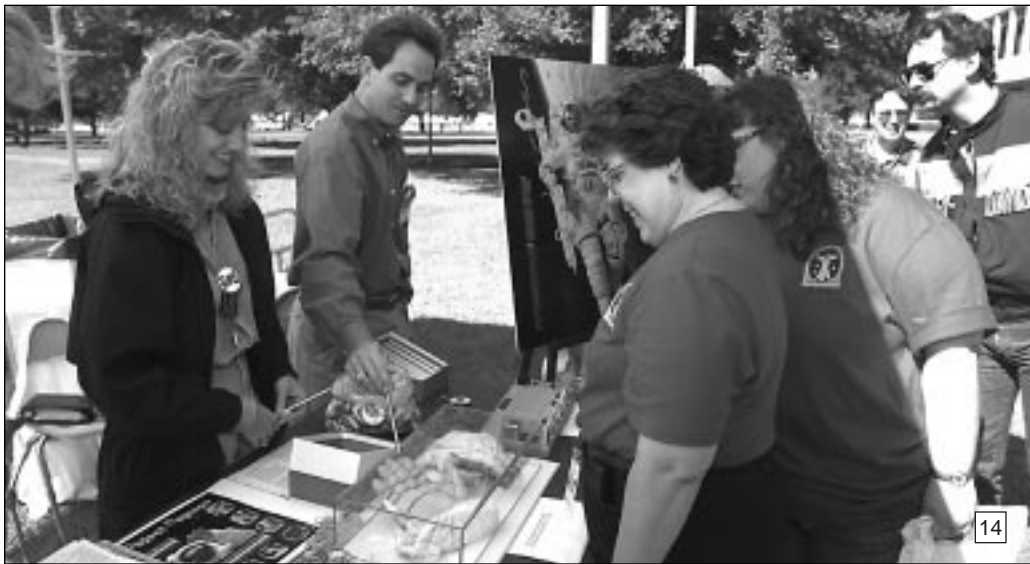
JSC Photo 97E04321