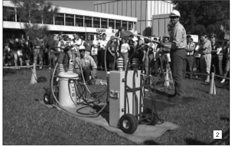
JSC Photo 97E04317