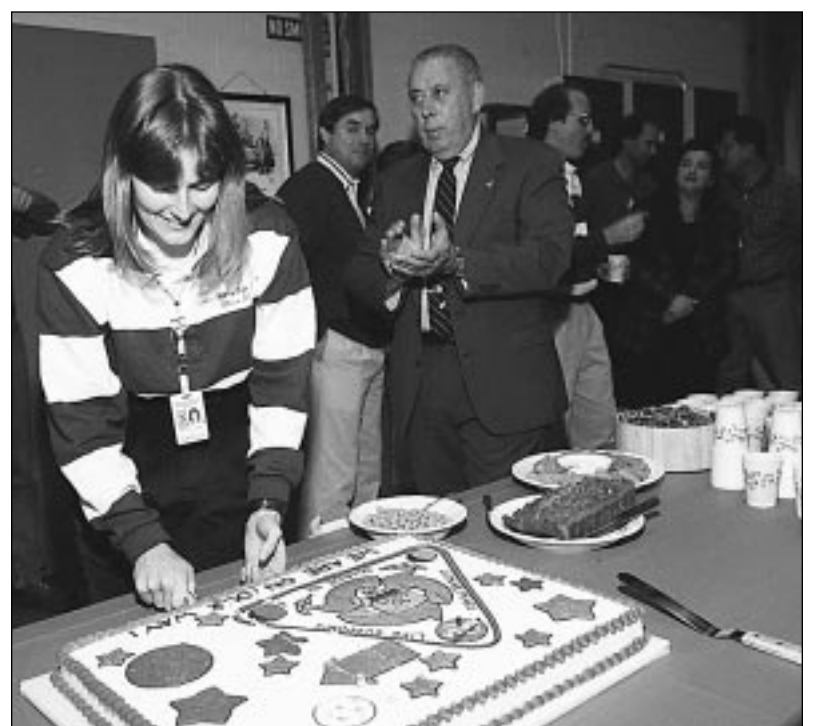
JSC Photo by Steve Candler

As always, the test can be visited on-line at http://pet.jsc.nasa.gov .