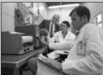
Twenty-seven years ago, JSC looked at making oxygen from lunar soil.