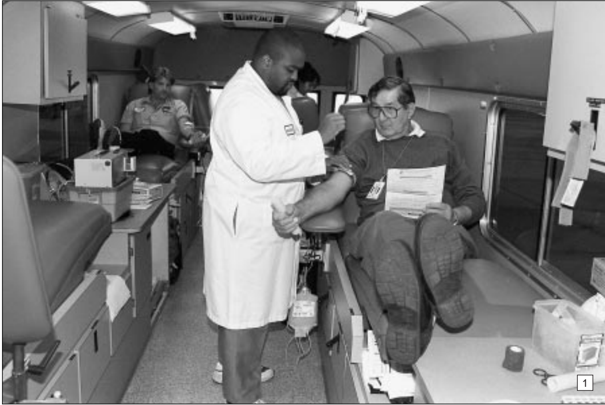
JSC Photo 97-15558