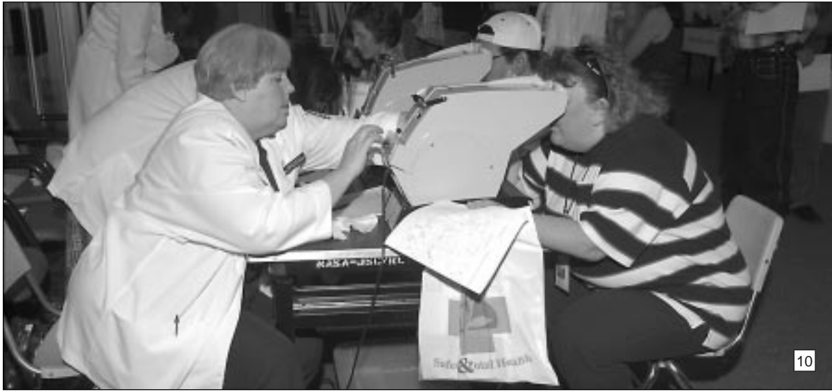
JSC Photo 97-15563