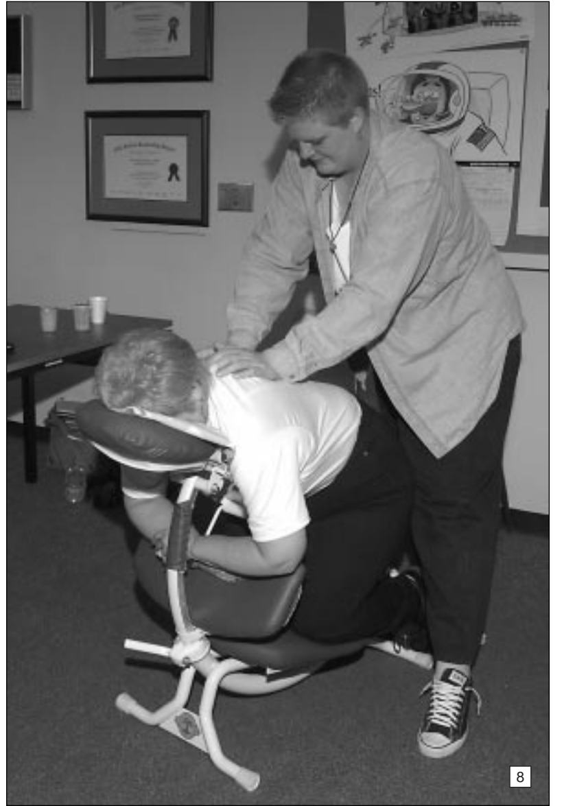
JSC Photo 97E04332