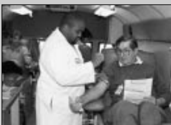
Photographs tell the story of a successful JSC Safety and Total Health Day.