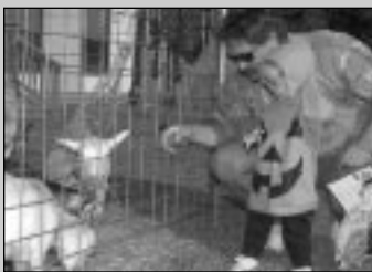
The JSC Child Care Center opens enrollment to off-site contractors.