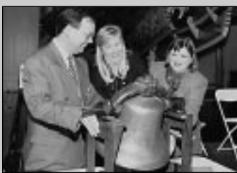
JSC, Space Center Houston dedicate a new Educator Resource Center location.