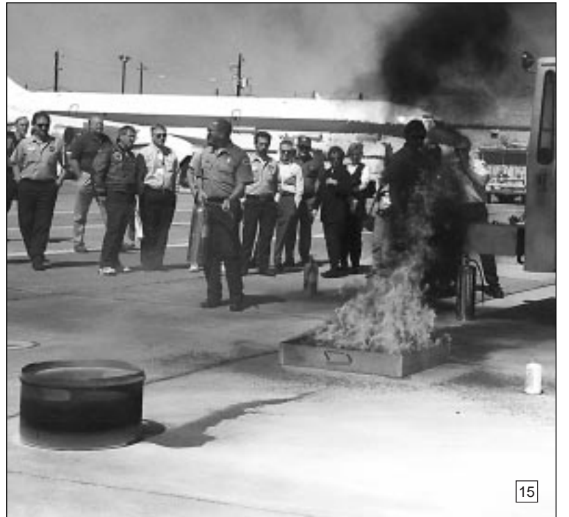
JSC Photo 97-15560