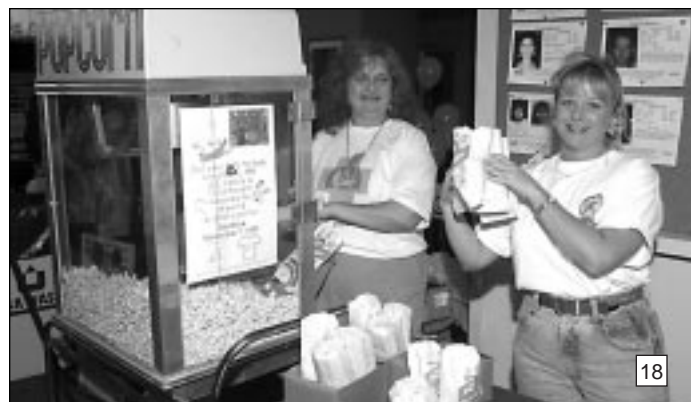
JSC Photo 97E04331