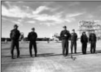
Employees and their families may visit Mission Control during STS-87.