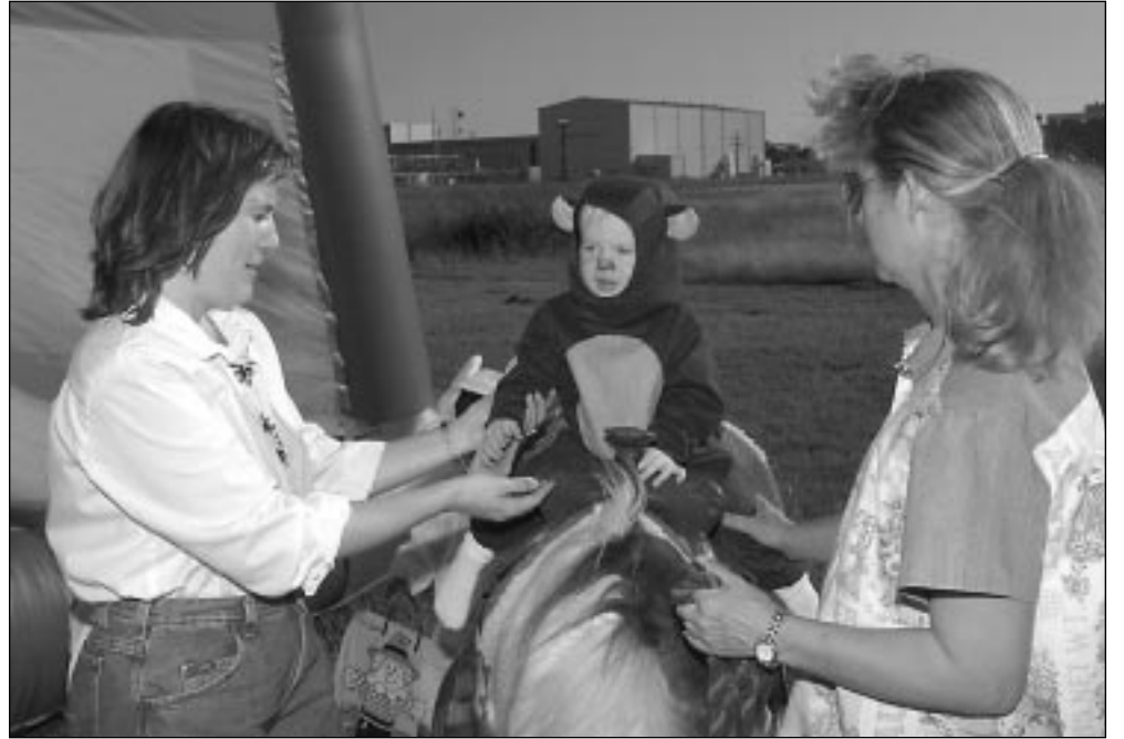
JSC Photos 97E04348, above, and 97E04346, below

The corporation was formed to provide parents and interested individuals at JSC with control and operation of the facility and to relieve the U.S. Government and NASA of any liability associated with child care. The primary source of financial support is through tuition fees paid by the parents and through community support, including fundraising activities handled by volunteers from the membership.