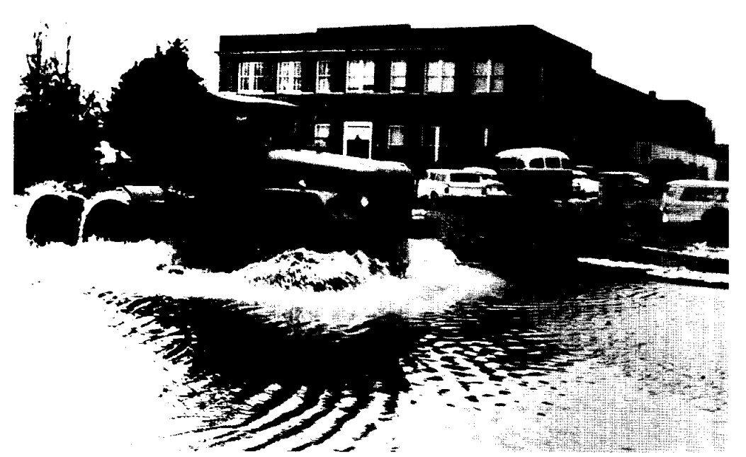
HIGH AND DRY, comparatively, occupants of this truck splash past the NASA Headquarters Building at Langley during the worst tidal flood in this area in 29 years. By the time this picture was taken most people had gone home. Those that were left were stranded—unless they liked wading.

and things were more or less on an even keel, except for jammed telephone service over the few remaining outside lines and a lack of heat through the next day in some of the buildings.