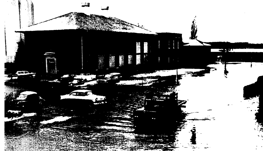
A SALT-WATER LAKE surrounds the building that houses the astronauts, the suit-room and the Alpha Trainer, among other things, at Langley AFB. The truck in the center of the picture was used to haul a small boat to the building nearest the waterfront. By mid-afternoon this area was dry again, as the tide receded.