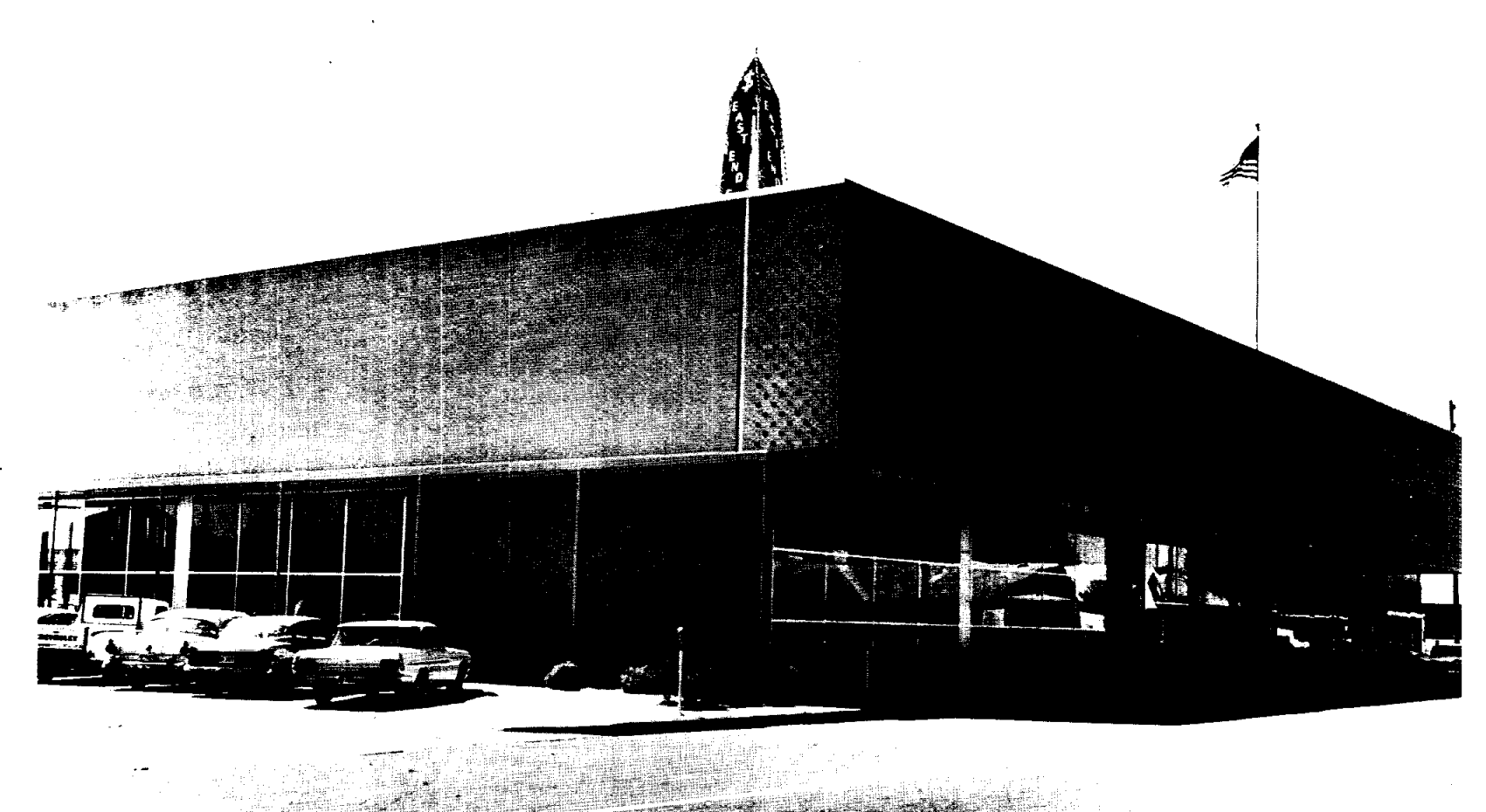
THE MOST RECENT ADDITION to MSC's Houston plant is the East End Bank Building, at 4200 Leeland. NASA will occupy some 15,000 square feet in the building, beginning sometime during the month of April. Tenants will include the Security Office, the Personnel Office and the recently-formed MSC Credit Union.