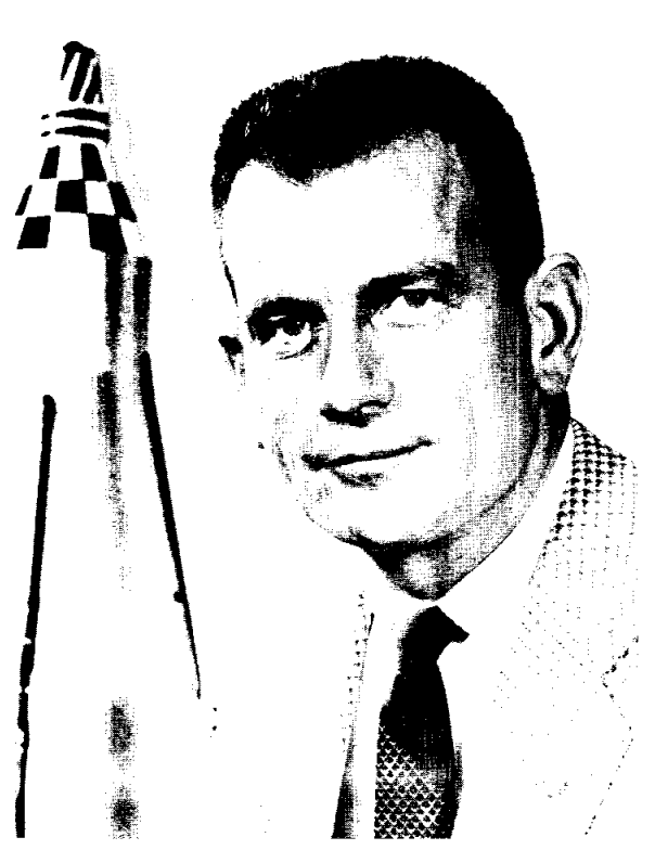
Astronaut Donald K. "Deke" Slayton