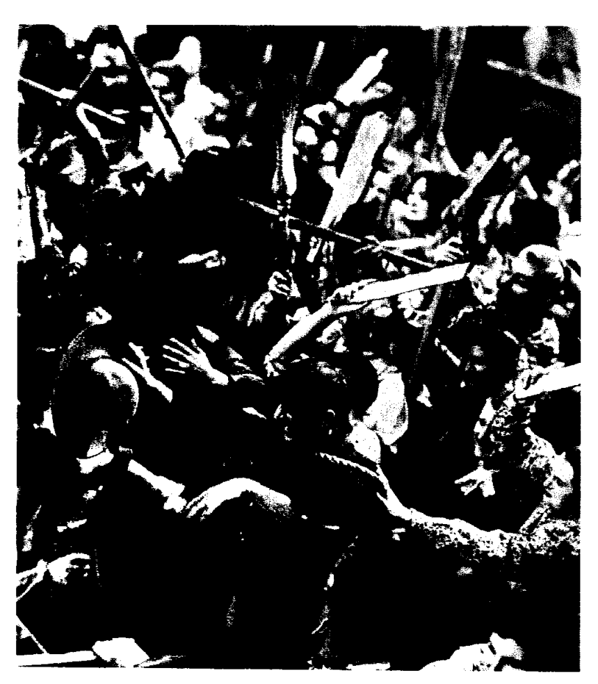
"There's one thing about these Mercury press conferences you can't deny--they're never dull."