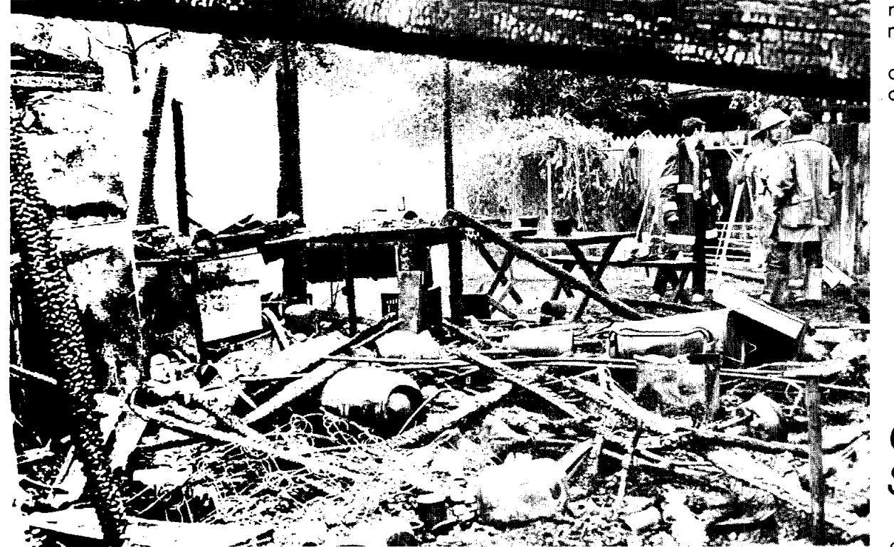
Fire Reduced This Clear Lake-Area Home to Smoldering Ashes

Americans to be reminded of and property of any of the in-