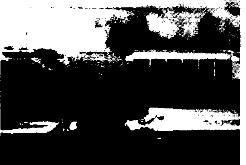
Waiting for a Replay Eyes remain focused on launch pad 39A awaiting a repeat of the spectacular first launch of Space Shuttle