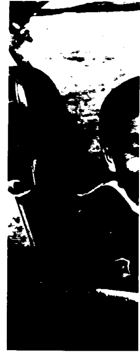
EI O dission