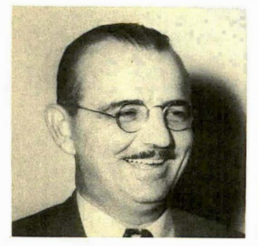
There's nothing berefered in Harris' boast That the 'stache he displays is bigger than most! He's close to the top with his growth of fuzz But the secret's out: He uses May make a winner - "by a DUZ!

Stability Division as its personnel continue to make important steps into the relatively new field of "Moustachability". Engineers are working overtime on this new project and compiling data for posterity. Free Flight funnel has just released for publication today the results of a series of measurements, conducted over a twelve day period, which indicate that the average growth per day of a moustache is .0116 inches. By delving deep into age-old difficulties of would be "hair-raisers", solutions have been discovered for the problems of itching, curly, wild, and disorderly locks. All authorities are in complete agreement that a brush weilded 100 strokes per night will add luster and that glistening look so admired by women. The calendar is a grim reminder that only one more week remains for those Stability males who are ineligible for the big contest to give their boyish countenances that suave "Man About The Lat" look that only a stache can add. Plus all the other glowing comments that have come from women-inthe know, the favorite of the day is a knowing miss' assurance that, "It adds a tickle to a thrill.