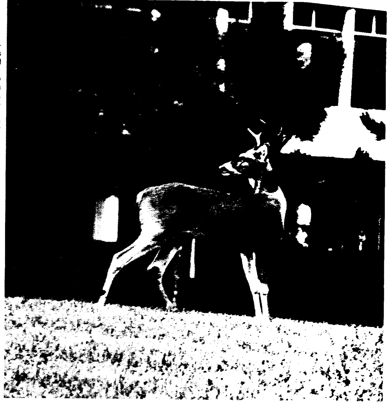
It's not a reindeer, but this JSC resident is as close as we come in Texas. The buck was photographed during an early-morning tour of the Center recently between Bldg. 4 and Bldg. 12.

Winter league activities Registration is now open for the winter season's mix of activities, such as men's, women's and mixed softball and league basketball. A mixed recreational volleyball league will also be offered. Deadline for entries is Jan. 3 at 5 p.m. The new season will begin in the first few weeks of January.