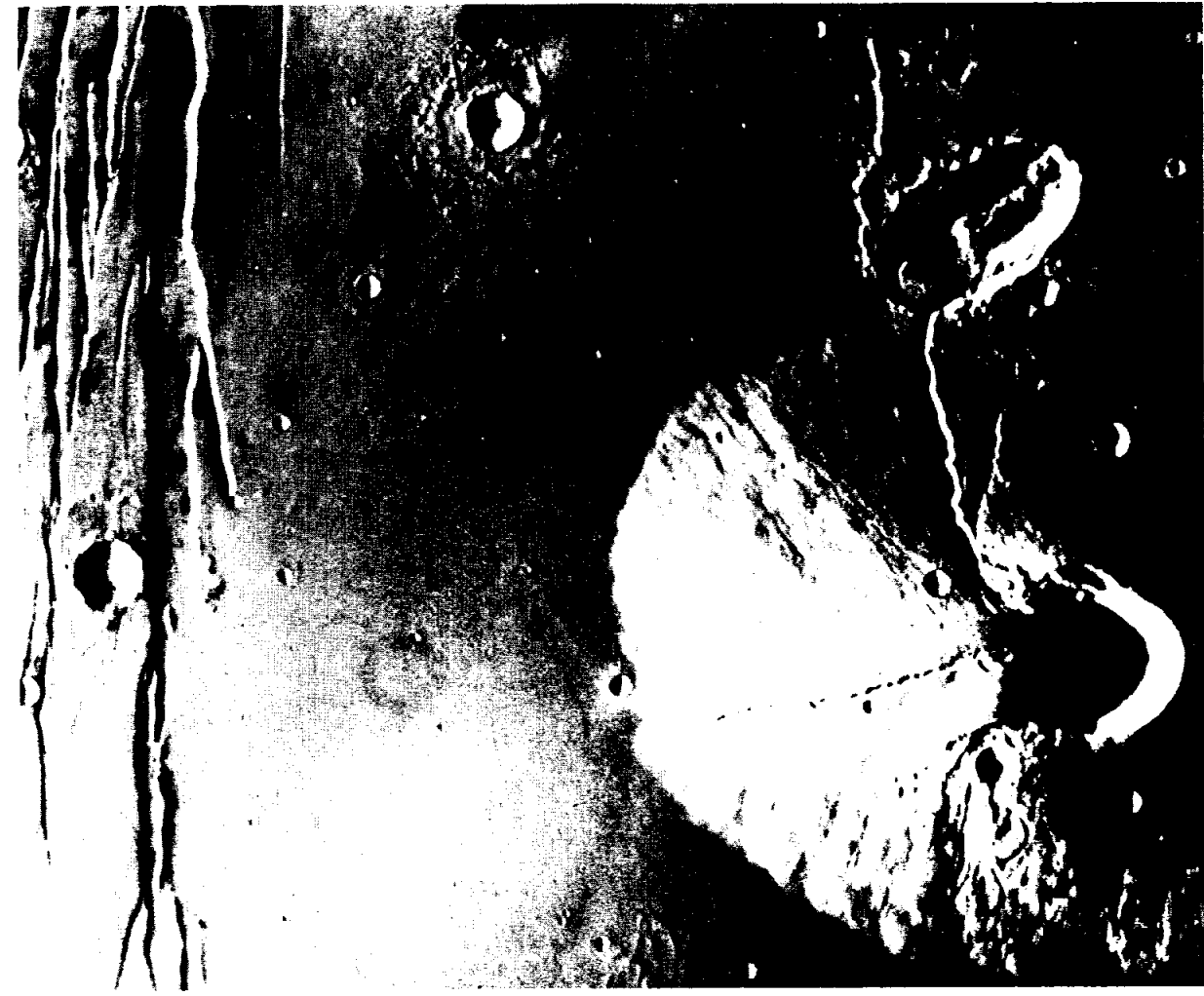
An example of the possible sources for Antarctic meteorite sample EETA 79001 is illustrated by this photo of the Ceraunius Tholus volcano in the Tharsis region of Mars, taken by one of the Viking orbiters. The large egg-shaped crater at the base of the volcano is indicative of a glancing impact by a high-speed projectile and is also obviously close to a source of igneous rock.