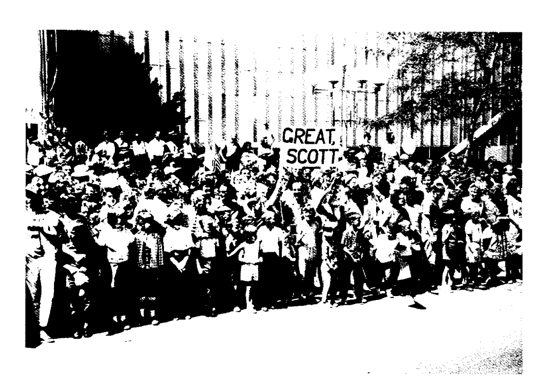
FLAG-WAVING AND sign-holding children by the thousands who were among the largest crowd ever to view a parade in the history of Colorado.