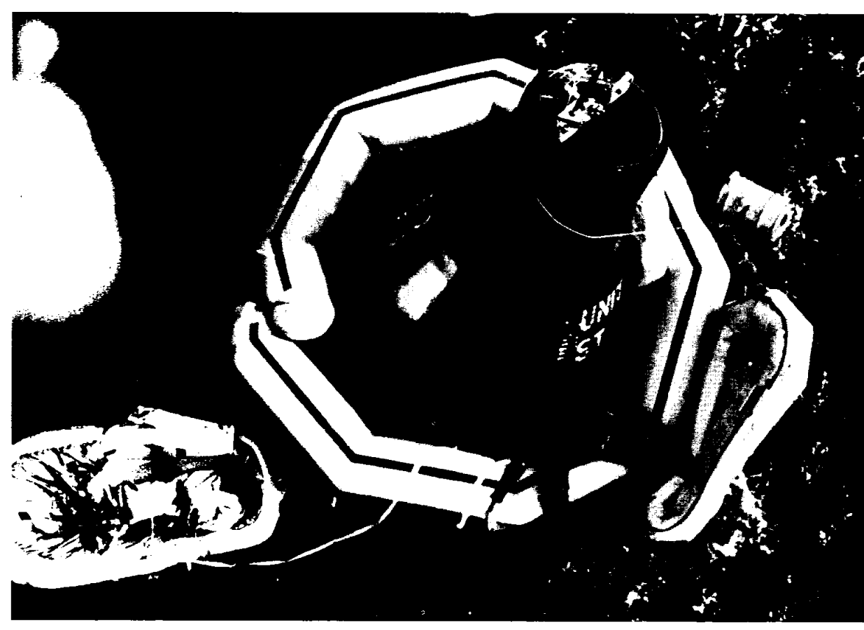
HER FLYING DAYS ENDED, "Aurora 7" floats quietly on the Atlantic, supported by a special flotation collar, hours after her three orbits about the earth.