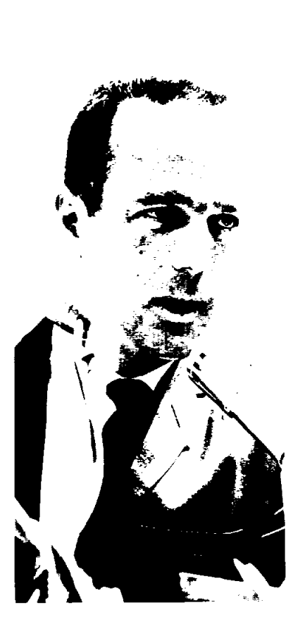
A HOMETOWN HERO expresses his gratitude to the people of Boulder and Colorado and proclaims his love for the state.