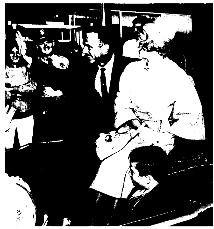
CARPENTER WAVES TO well-wishers as the motorcade leaves the Harvest House for ceremonies at Folsom Stadium.