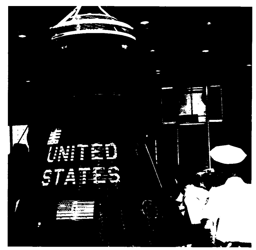
MEANWHILE THE SPACECRAFT starts the long trip back to Cape Canaveral aboard the destroyer Pierce, which picked it up several hours after Carpenter was returned to the Intrepid.