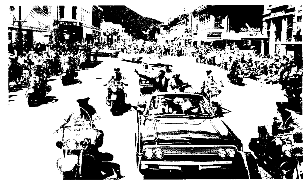
A CHEERING CROWD of an estimated 75,000 persons acclaimed Carpenter as the motorcade moved through downtown Boulder following the stadium activities.