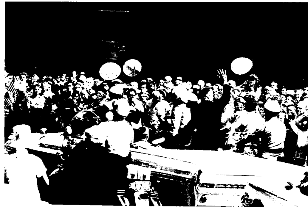
ONE VIEW OF the estimated crowd of 250,000-300,000 people who jammed downtown Denver to see Carpenter take part in the Memorial Day parade.