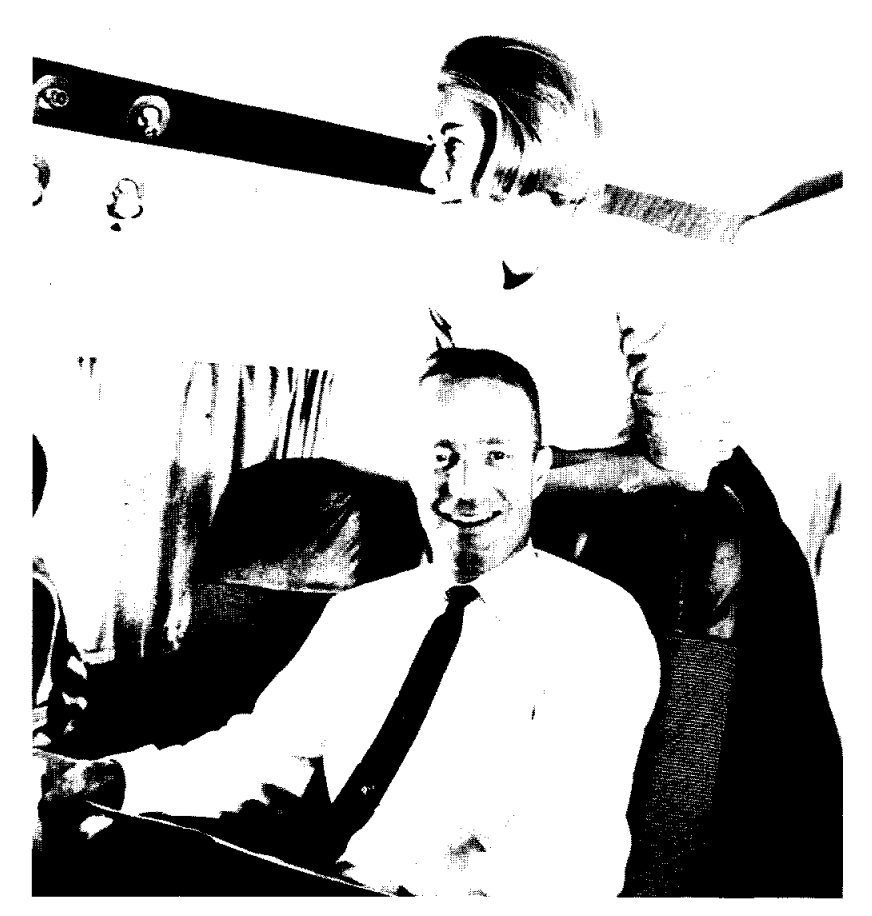
TWO HAPPY CARPENTERS relax during a quick trip from Patrick AFB to Denver's Stapleton Field.