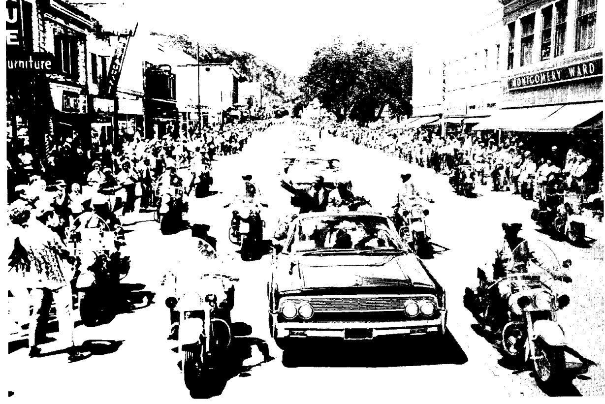
ANOTHER VIEW OF the Boulder crowd as the motorcade moved downtown. Carpenter's beloved Rocky Mountains are shown in the background.