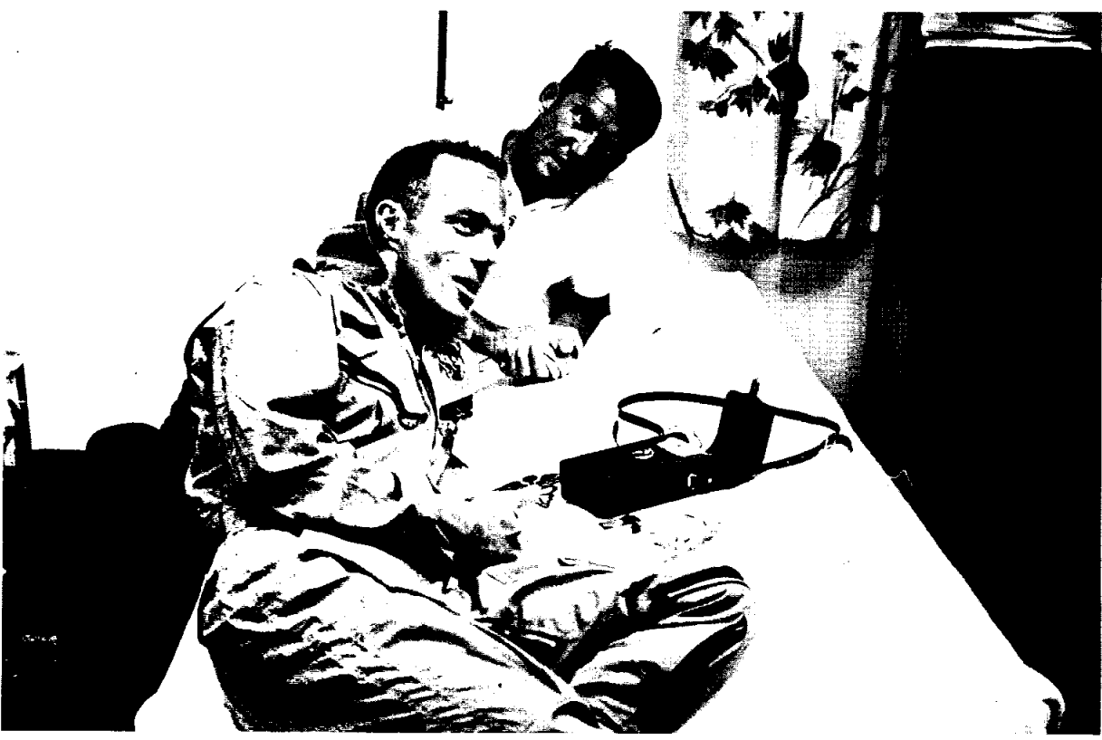
RELAXING AT GRAND TURK, Carpenter discusses the mission with fellow astronaut and backup pilot Wally Schirra.