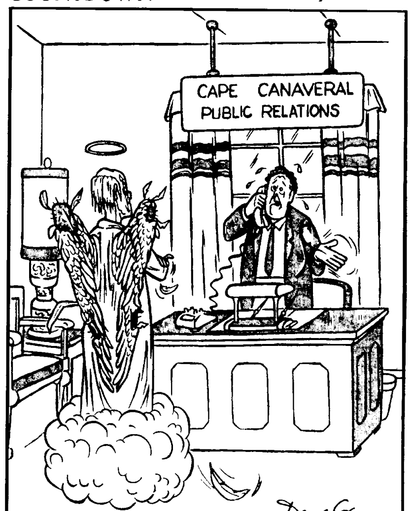
"About those luminous particles you saw, Commander, could they have been feathers?"-San Francisco Chronicle