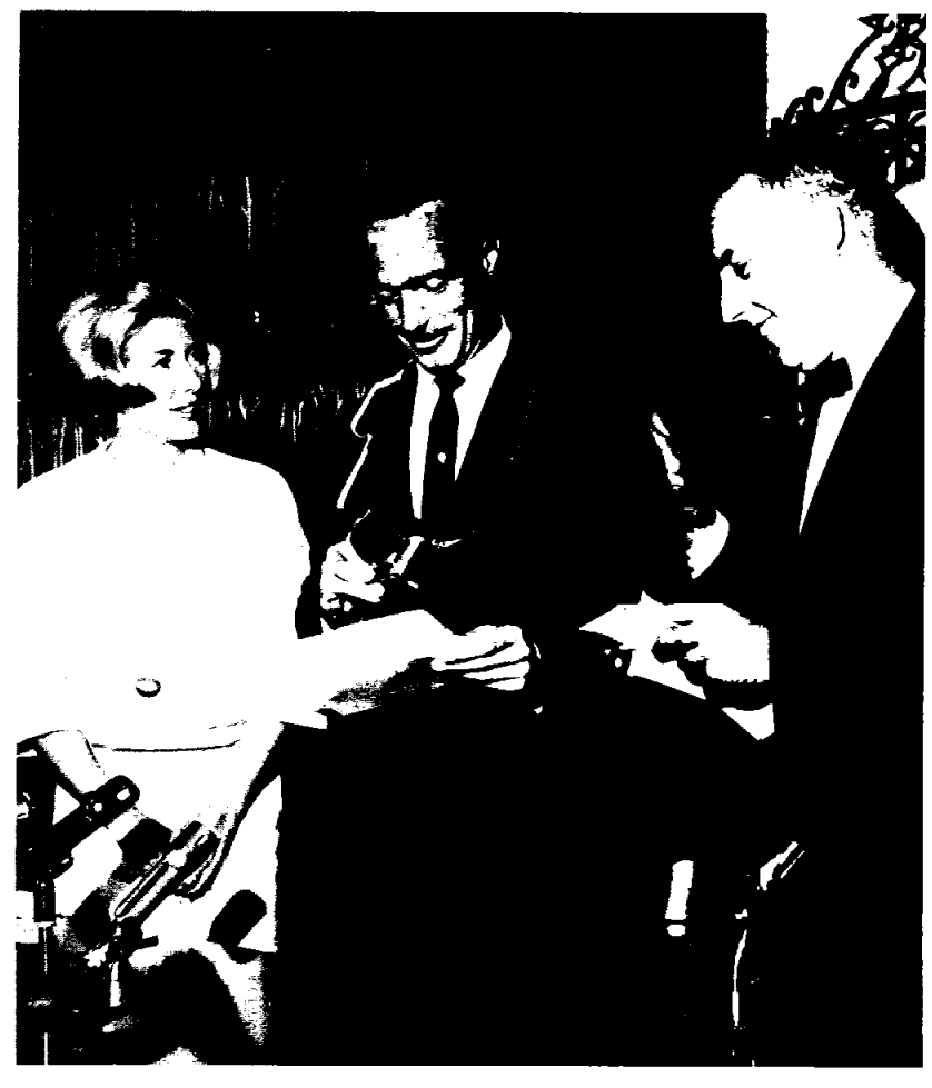
THE COLORADO PRESS Photographers Association had still another gift and an honorary membership for one who qualified by taking pictures in space.