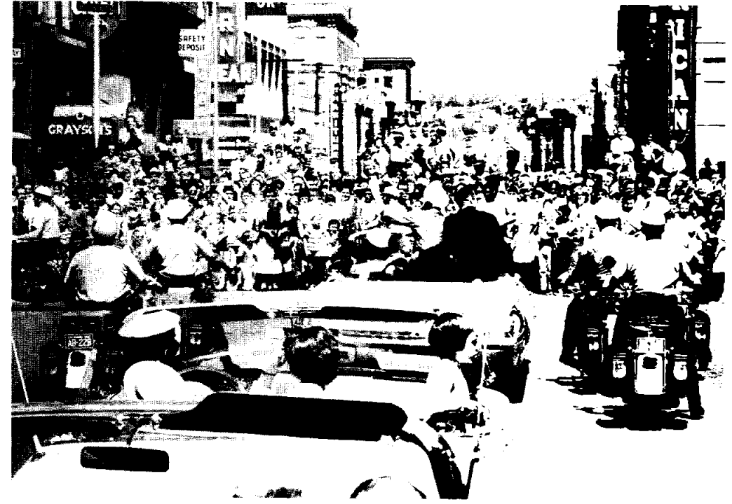
DENVER POLICE OFFICERS had their hands full as they tried to hold back the crowds which wanted to touch Carpenter or to get his autograph.