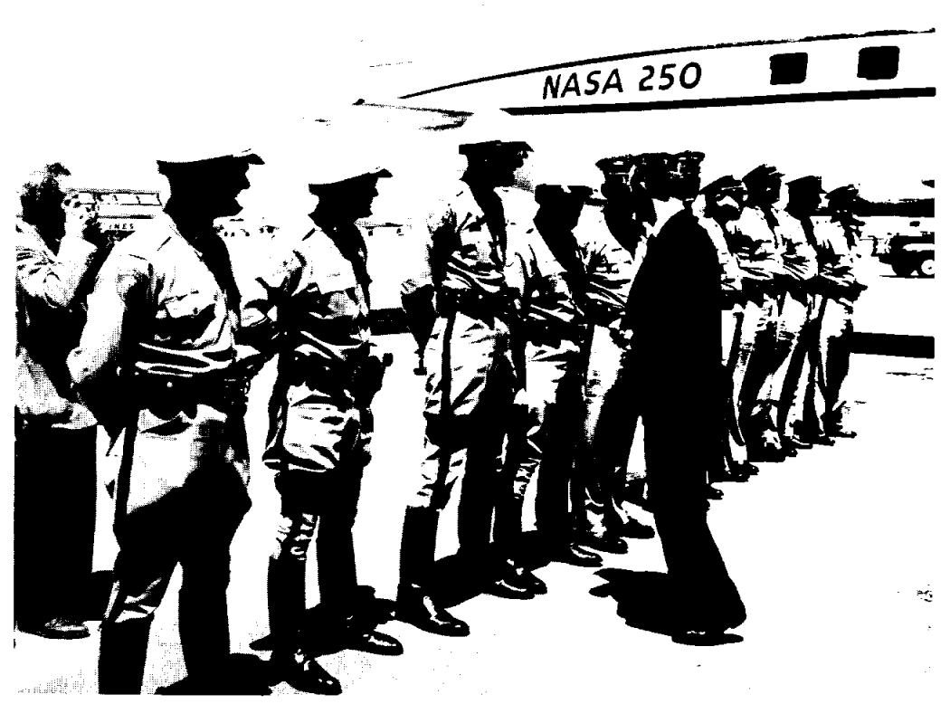
BEFORE LEAVING DENVER for Langley AFB, Carpenter took time out to thank the police for the fine cooperation and protection he had from them during the ride through Denver and in the parade.