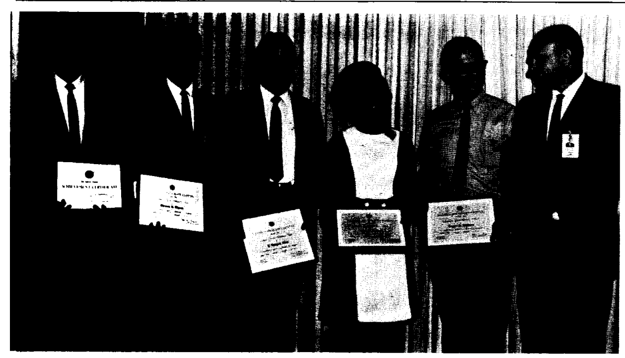
APOLLO APPLICATIONS PROGRAM PERSONNEL RECEIVE AWARDS FOR SERVICE