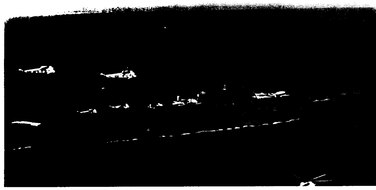
PRIME RECOVERY SHIP USS HORNET SPEEDS TO MID-PACIFIC SPLASHDOWN SITE Apollo 11 was to have landed at 12:46 p.m. Thursday, 1040 nautical miles Southwest of Honolulu, Hawaii.