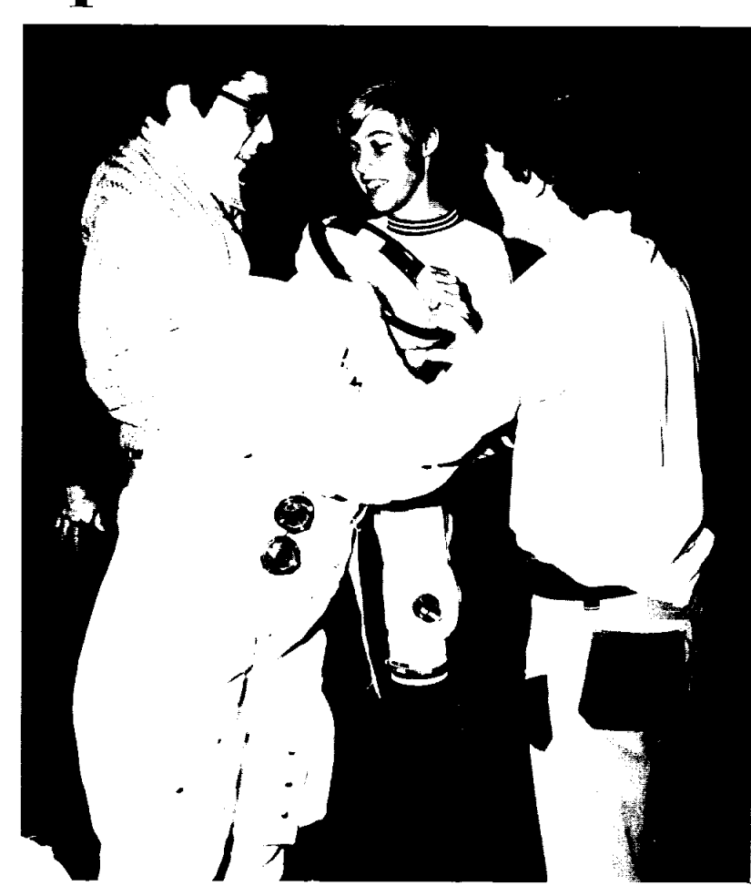
NOT SO SIMPLE-These young men realize that it's not so easy to get into a space suit, even a mockup one! These students are participating in the Space Science Education Project