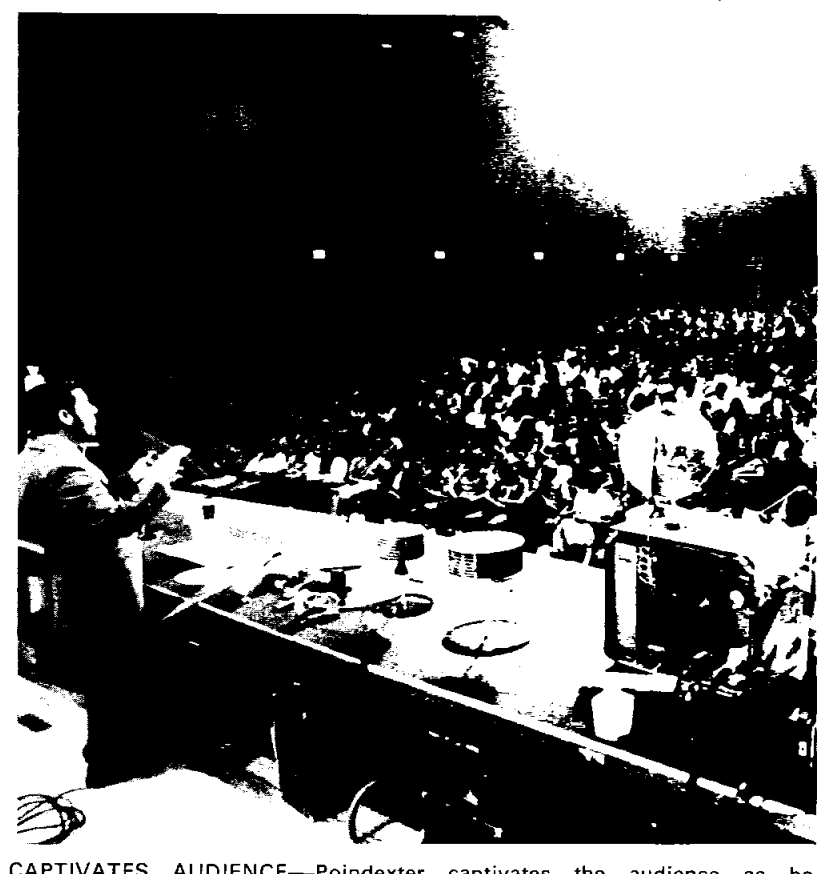
CAPTIVATES AUDIENCE—Poindexter captivates the audience as he explains scientific principles used in the exploration of space.