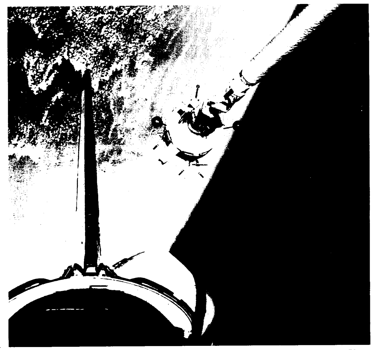
Against the limb of Earth, Columbia and the Shuttle program's first grappled payload, the Plasma Diagnostic Package, are seen at work during the recent STS-3 mission.

STS-3 crew describes longest Shuttle flight yet