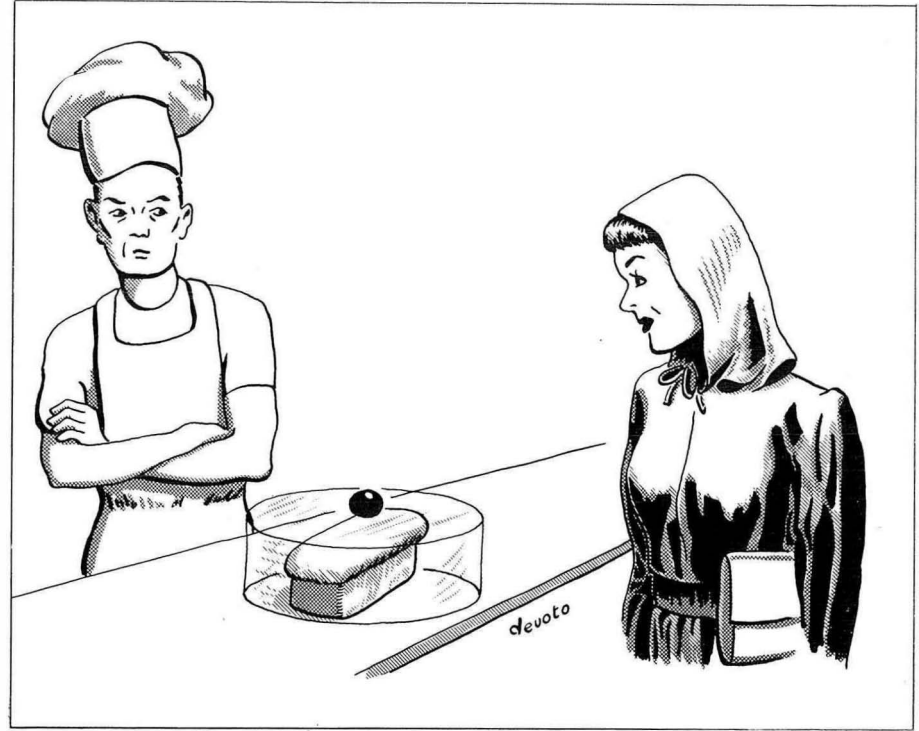
"Yes. I know - but how much is it a slice?"