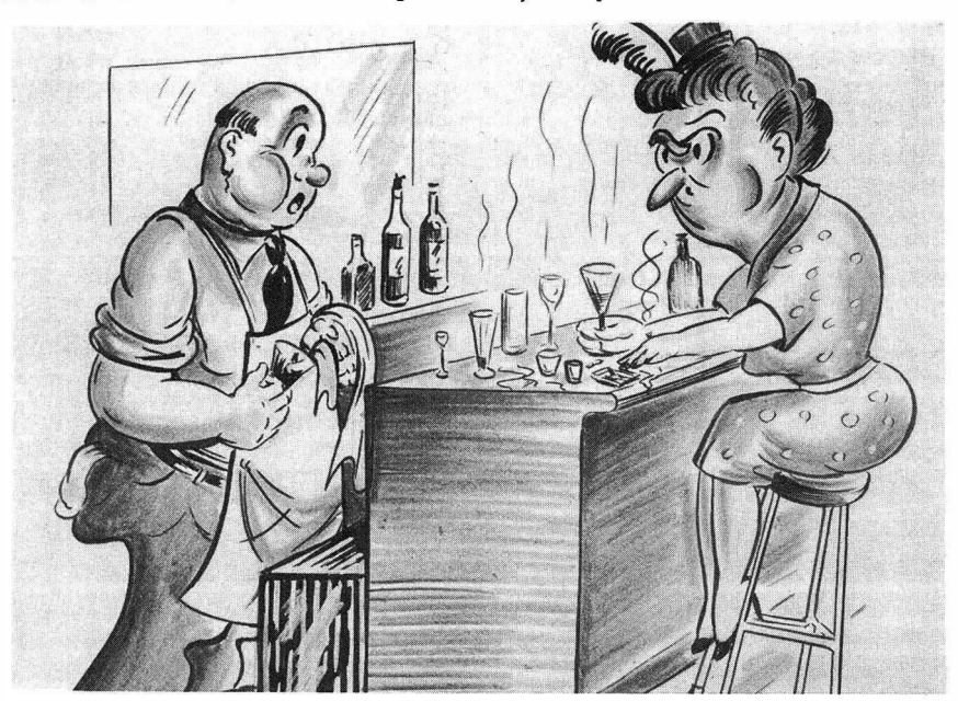
"I always have lemon in my drink. Understand, Sour-Puss?"

the fairer sex are invited to attend a dance for a large group of college men at the Boat House on Friday, June 27 from 9 p.m. 'til midnight. The dance will be formal and music will be furnished by the Base Orchestra. The men, about 450 in number, will arrive at the Base next week for a six week training period in the R.O.T.C. The average is around 23 or 24 and they come from such colleges as V.M.I., Umiversity of Kentucky, University of Indiana, Ohio State, Johns Hopkins University, and several other large universities. Rides to the dance will be furnished by the Army and girls interested in attending are asked to contact the "Air Scoop" Office, telephone 2376.