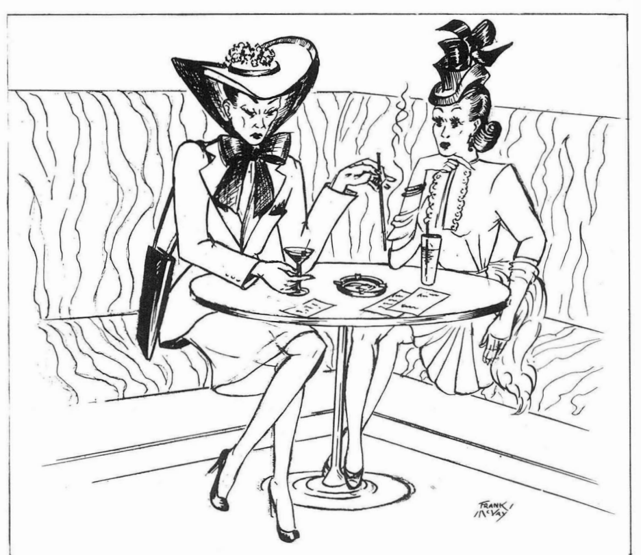
"But, my dear, men are like this olive. You seldom like the first one."

WANTED: Portable radio - must be cheap. "Air Scoop" Office, 2376.