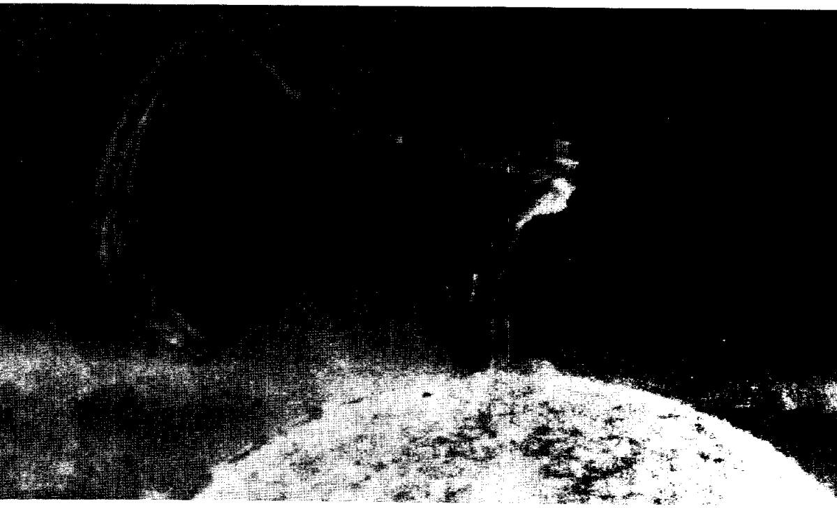
Spectroheliogram of solar flare taken during Skylab 3 (1974)