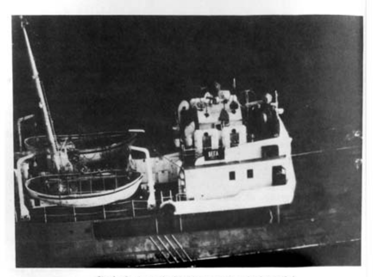
Fig. 1. Russian travier Vegs, heme port, Murmansk, photographed while maneuvering off East Coast of United States.