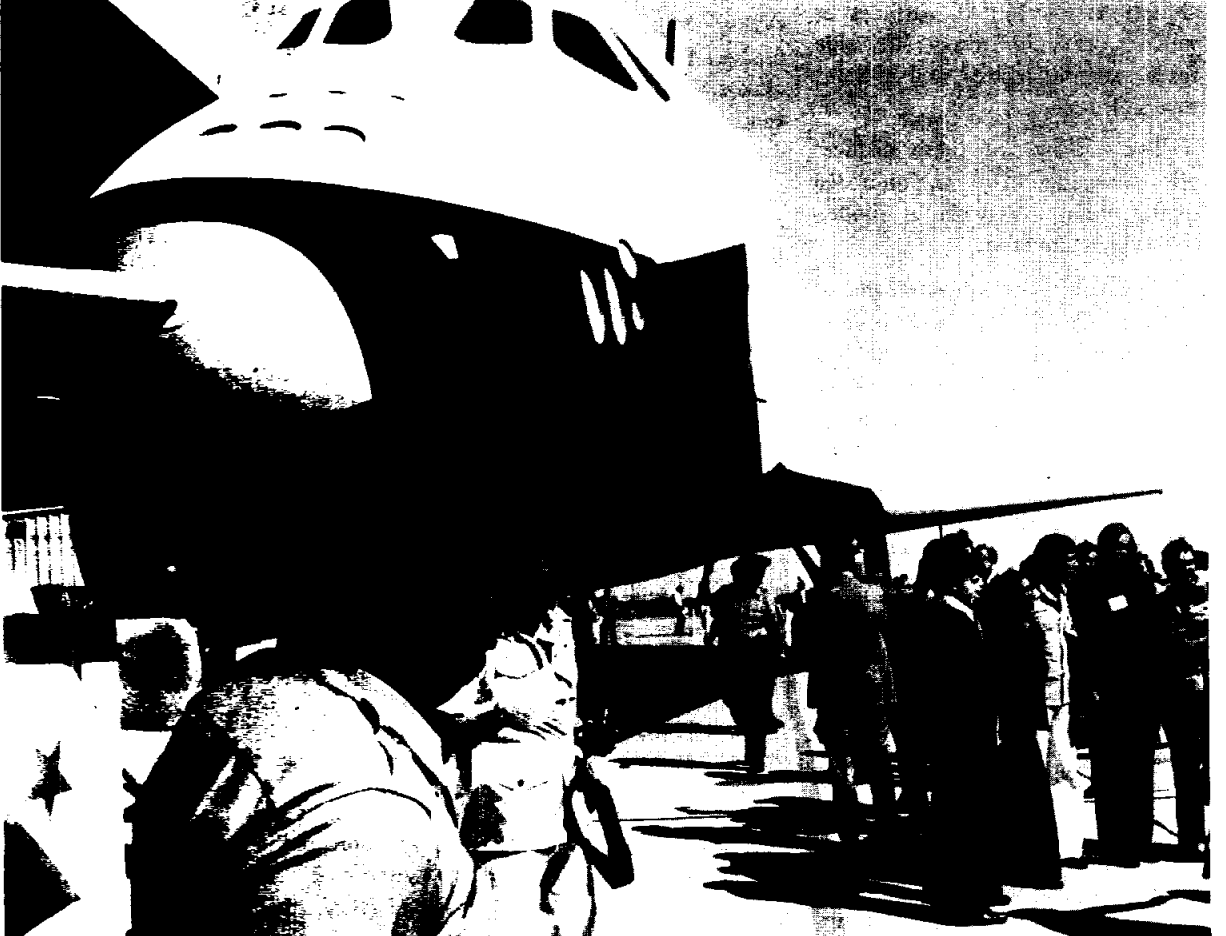
STAR TREKERS - Gene Rodenberry, second from right, creator of the science-fiction television series Star Trek, is flanked by members of the show's cast who were on hand for the unveiling of the Space Shuttle Orbiter. The name chosen

Back toward Palmdale, work out sat in the press section near crews were already relocating telephone poles and Joshua trees in preparation for the overland move of Orbiter 101 from Palmdale, 35 miles to Dryden Flight Research