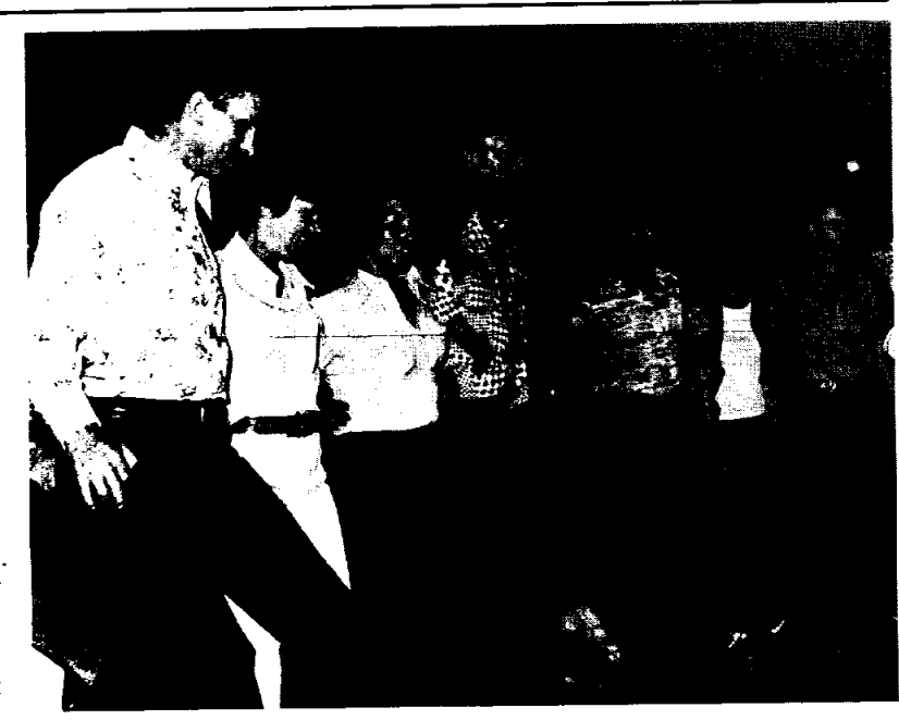
WESTERN FUN - There's nothing to get even the most reluctant dancer into the action like a rousing "Cotton-Eyed Joe." These participants in the EAA Country Western Dance, Sept. 11, display their style, or lack of it, on the dance floor at the Gilruth Recreation Center. Those present really got into the swing of the music as the evening wore on

The cost-plus-fixed-fee contract begins Oct. 1, and runs through Sept. 30, 1977. It has an estimated value of $451,000. Di-Jay will employ about 24 people for the contract.