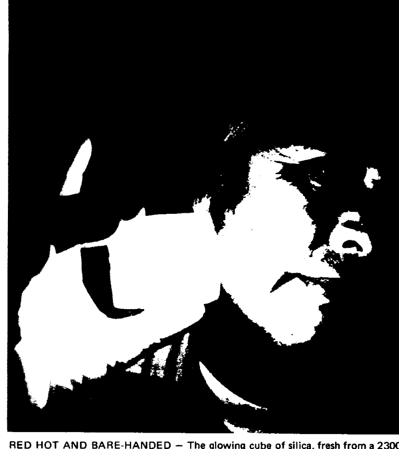
RED HOT AND BARE-HANDED - The glowing cube of silica, fresh from a 2300 degrees F oven, provides the only light in this photograph as a technician holds it in his bare hand. The demonstration illustrates the remarkable speed at which heat is cast off by the unique silica insulation being manufactured by Lockheed for the

Bauer noted that the Speakers Bureau receives at least 300 off-site speaker requests per year, of which more than 90 percent are filled.