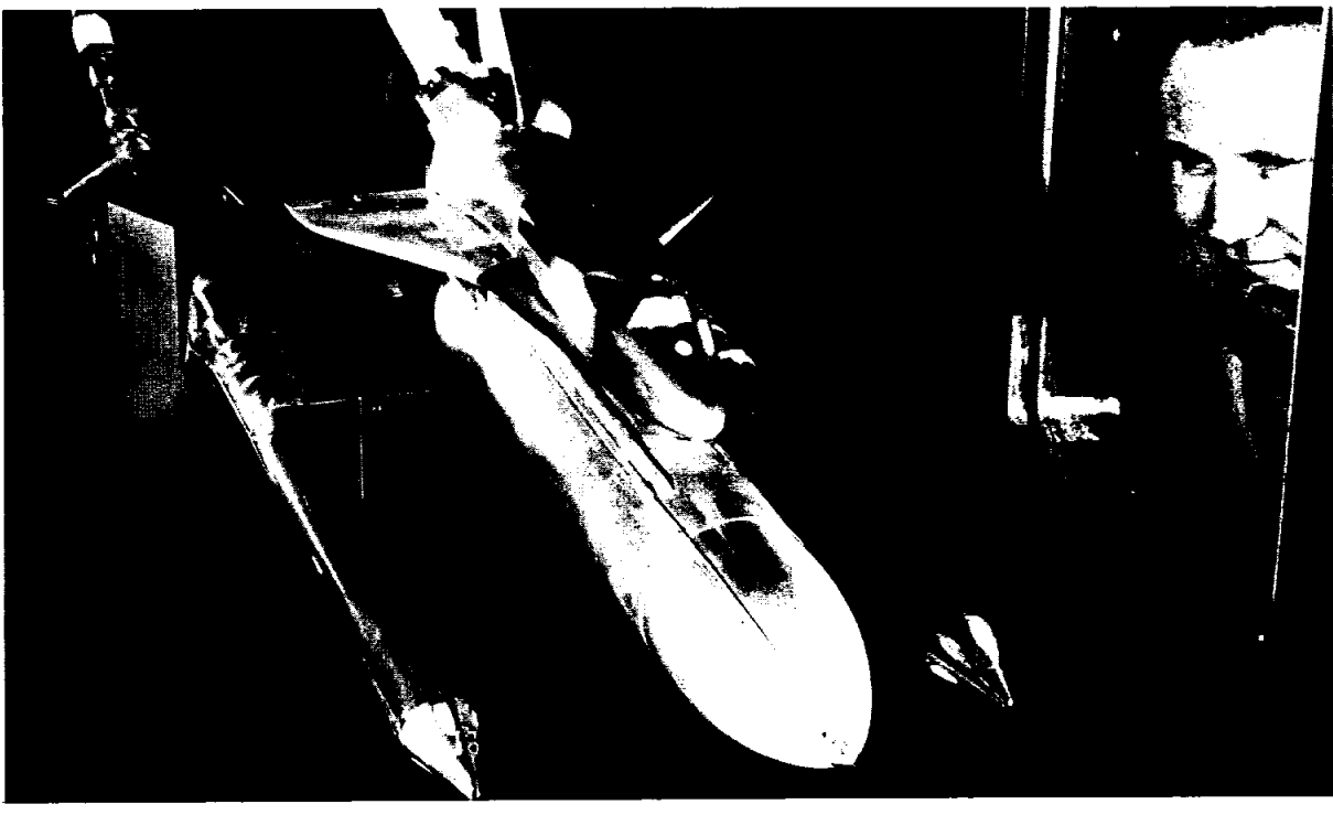
SHUTTLE SEPARATION STUDIES - A test facility craftsman at the Air Force Systems Command's Arnold Engineerphases of Shuttle before the Orbiter ing Development Center (AEDC), Tenn., conducts a pre-test reaches the altitude of 75,000 feet. check of the dual support system which controls the separa-

Subsequent dynamic tests will determine the effectiveness of the system during inflight phases of the ALT program and during launch