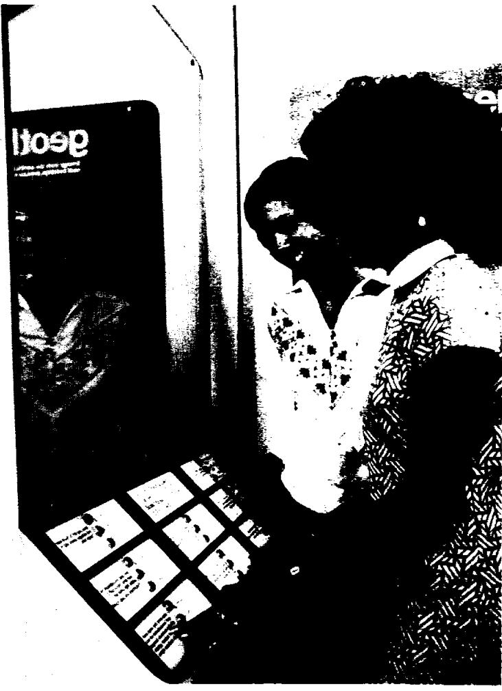
HOW'S YOUR EQ? - These young women are testing their EQ's (Energy Quotients) on one of the consoles at ERDA's ENERGY exhibit now on display on the Bldg. 14 parking lot. The quiz asks visitors questions such as "How much of the gas used in gas stoves supplies the pilot lights?" For the answer, visit the exhibit.

"Cheryl's performance this past term has been excellent," Cherry added. "She is invariably up-to-date on a growing number of assignments and her purposeful approach in dealings with outside offices has been effective beyond our expec-