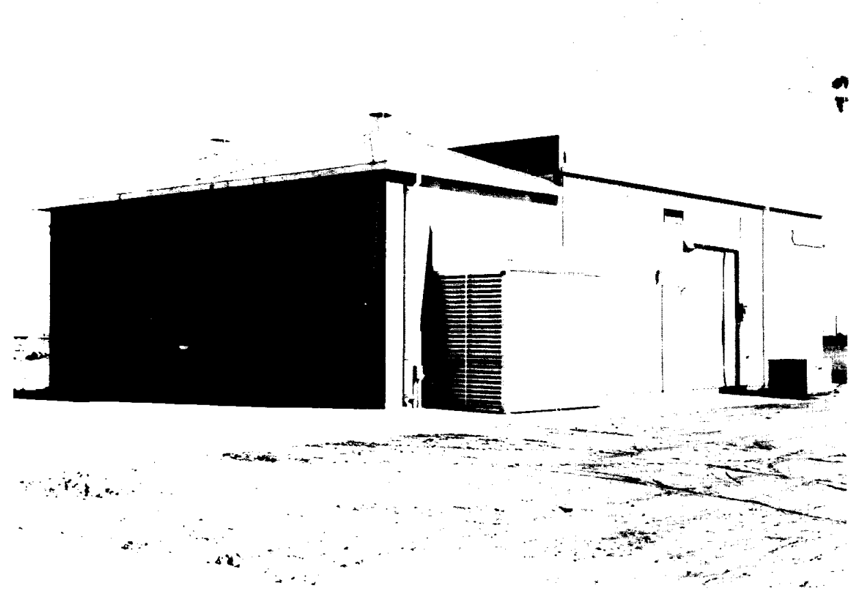
IT'S NOT BEAUTIFUL, but it can do the job, at least until the permanent facility for space power systems testing is completed at Clear Lake. This temporary facility opened for business recently at Ellington AFB.