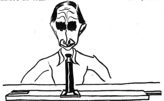
M-m-m-accurate to six places.