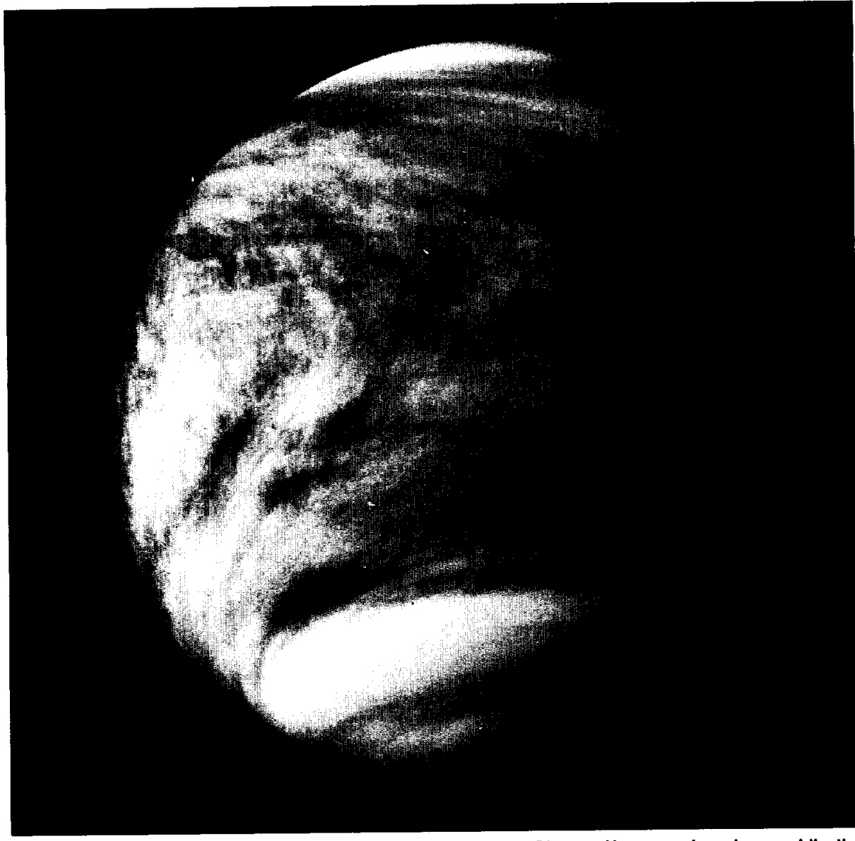
Venus appears in gibbous phase as seen from the American Pioneer Venus probe, above, while the surface of Venus is seen below in an image from the Soviet Venera-14 spacecraft.

Using the signals from the combined array of at least 10 antennas worldwide, in addition to data from the Soviet network, scientists can calculate in detail the balloons' locations and motions, using a radio astronomy technique known as Very Long Baseline Interferometry (VLBI). This technique can measure balloon velocity, and precision of approximately two miles per hour at a distance of 67 million miles from Earth.