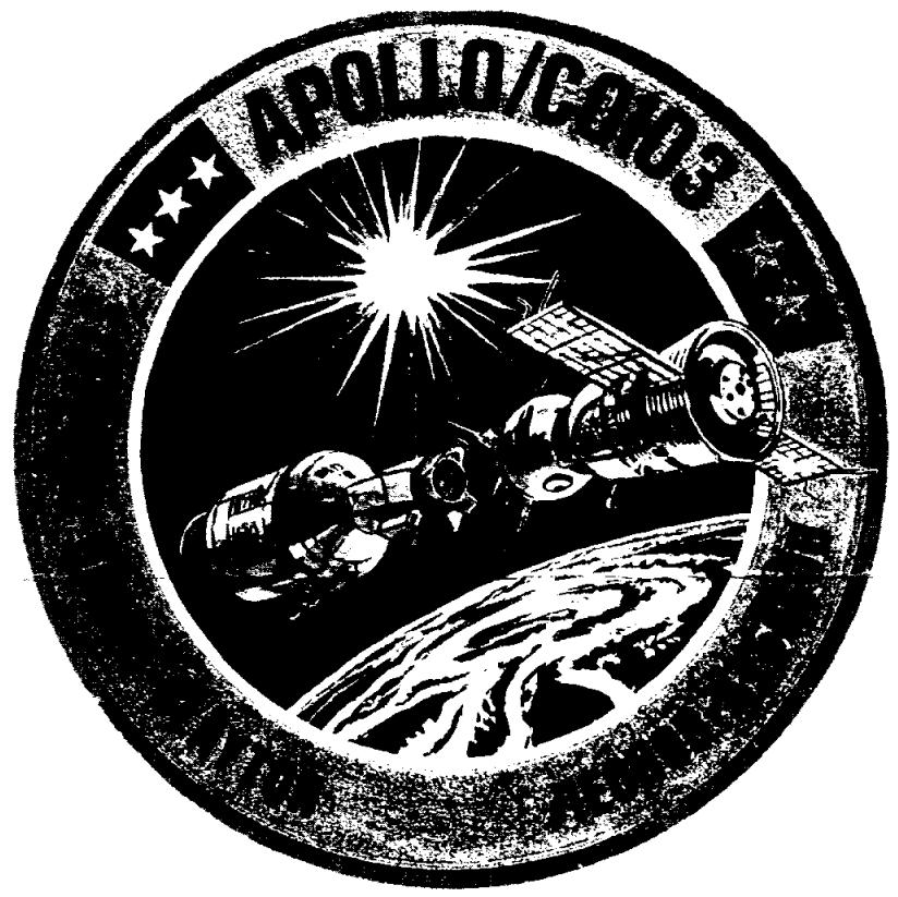
ASTP CREW PATCH-This is the American crew patch of the joint U.S.-USSR mission scheduled to take place in July. Of circular design, the patch has a border area with the names of the five crewmen and the words Apollo in English and Soyuz in Russian around an artist's concept of the Apollo and Soyuz spacecraft about to dock in Earth orbit.

The Freedom Shrine is a series of 28 historical American documents, including the Declaration of Independence and the Gettys-(Continued on Page 2)