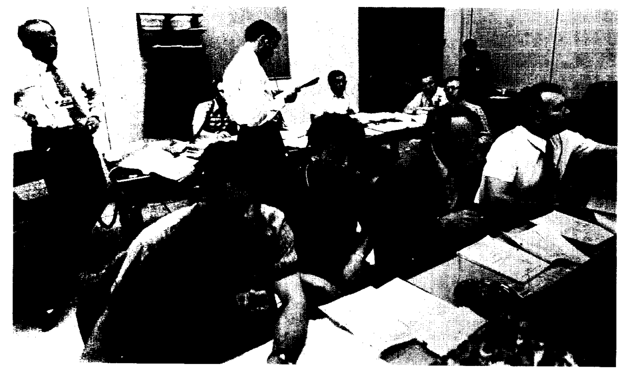
FLIGHT CONTROLLERS-Soviet Flight Controllers are pictured in the support room next to the MOCR. They are taking part in the ASTP mission simulations scheduled to end today.