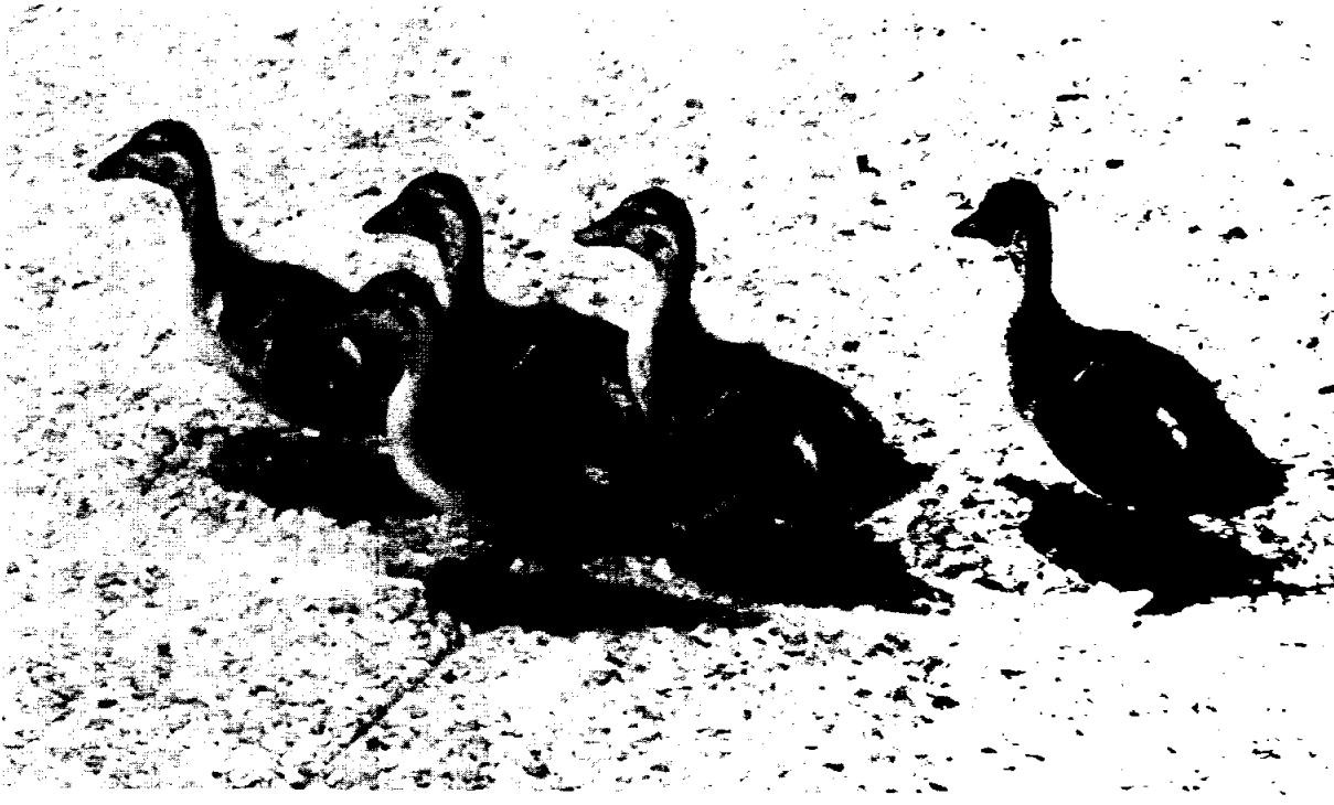
CLOSEUP THOSE RANKS, SOLDIER - JSC's latest flock of ducklings seemed to be marching in military drill style

For information on the trip or the films, contact Gonzalo Abotteen (6-2, 6-3) Montoya, 488-5660.