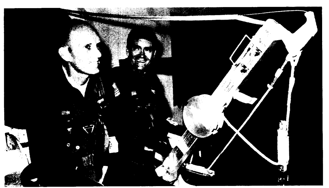
BREAK IN TRAINING - ALT crewmen C. Gordon Fullerton, left, and Fred W. Haise Jr. take a break during emergency egress training in Bldg. 9-A. The astronauts used

Carter concluded the proclamation by calling for commemoration of "the achievements of the United States space program which demonstrate that advanced technology devoted to peaceful purposes can lead the way to a better life for people of all nations."