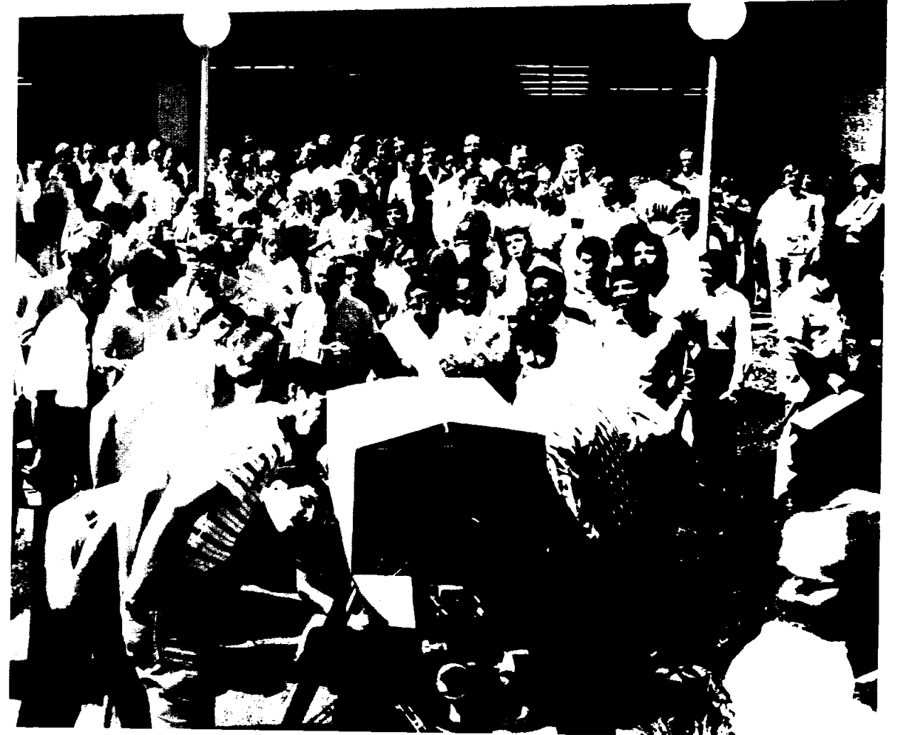
The grounds in front of Bldg. 16 were filled with eclipse watchers May 29 as the Sun was almost totally obscured by the Moon in the skies over Houston.

Weight safety — This is a required course for all persons interested in using the weight room at the Rec Center. The class will teach you how to use the machines with safety stressed. The next available class in the series meets from 8 to 9:30 a.m. beginning June 29. The cost for the one-day class is $4 per person.