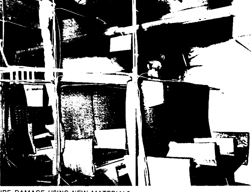
FIRE DAMAGE USING NEW MATERIALS.

Additional tests in the aircraft fuselage are planned, including an external jet fuel fire simulating a crash fire during takeoff or landing.