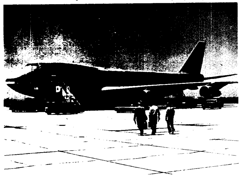
ENROUTE TO EDWARDS AFB-This American Airlines 747 recently obtained by JSC for use in transporting Space Shuttle Orbiter and related Shuttle hardware cross country is shown prior to its delivery to the NASA Flight Research Center, Edwards Air Force Base, California. The 747 will also be used in the planned approach and landing tests of the reusable Orbiter. The aircraft was transferred from American Airline facilities at Tulsa, Oklahoma to the California facility several weeks ago for verification and test flights.

The presentations are to be made at the 20th annual meeting of the American Astronaut- University ical Society (AAS) in Los