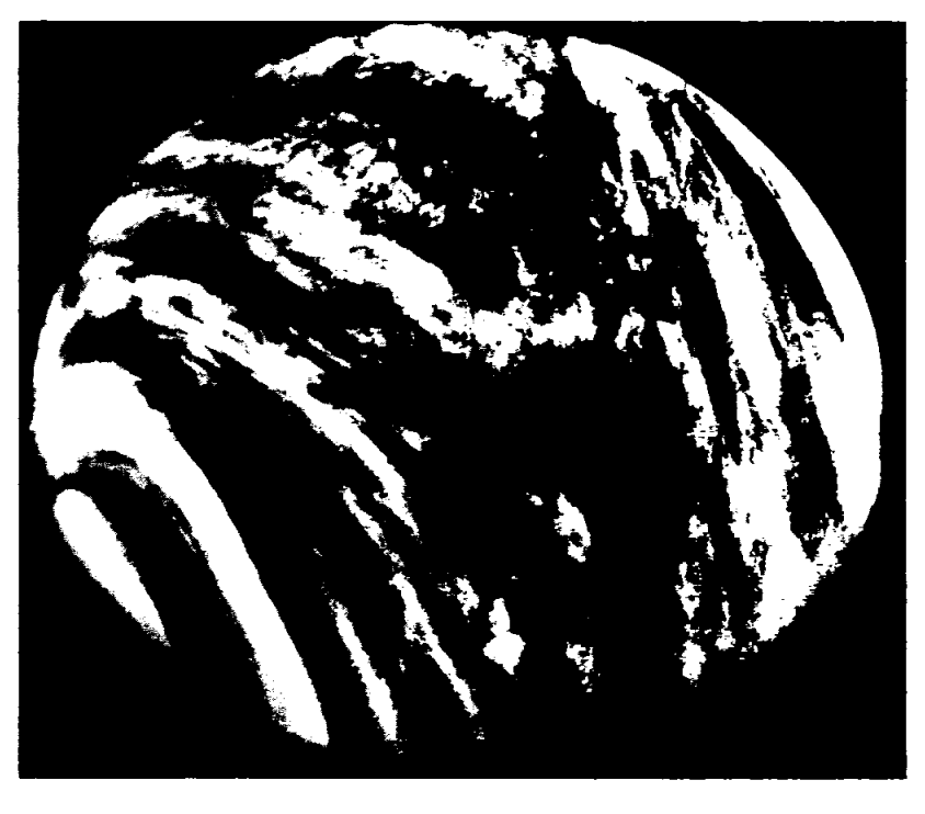
THIS ENHANCED VIEW OF VENUS-was taken by Mariner 10's on-board TV camera and processed through the JPL Image Processing Lab. Claifornia in Venus' upper atmosphere from the equator through the poles.

The Pioneer Venus mission is managed by the Ames 'research Center, Mountian View, Calif.