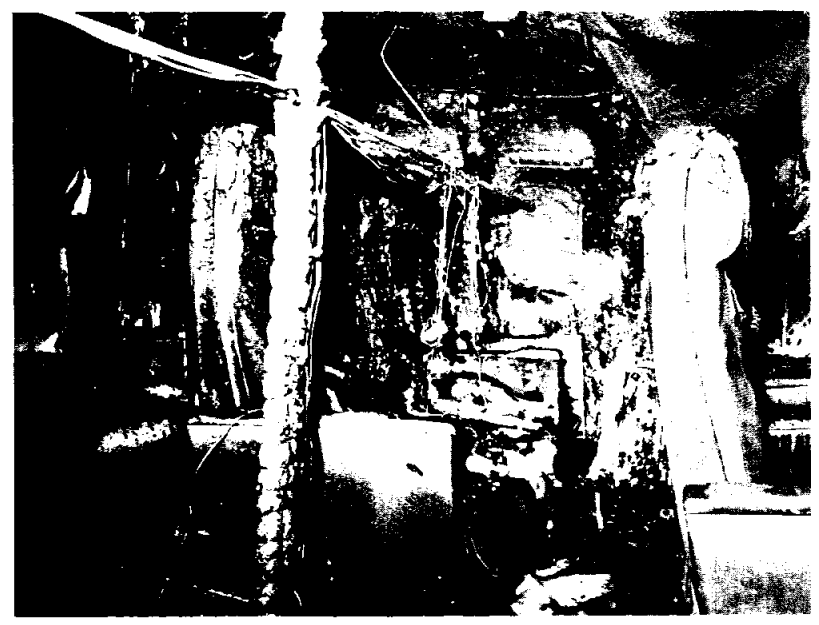
FIRE DAMAGE USING PRE-1968 MATERIALS

The test was one of several tests in which inflight and crash fires simulated for measuring the degree of increased protection for passengers and aircraft offered by the new materials.