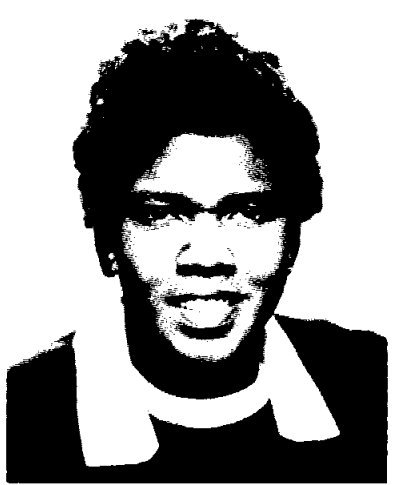
REP. BARBARA JORDAN over a legislative body in the United States when she was un-(Continued on Page 4)

In March, 1972, she became the first black woman to preside