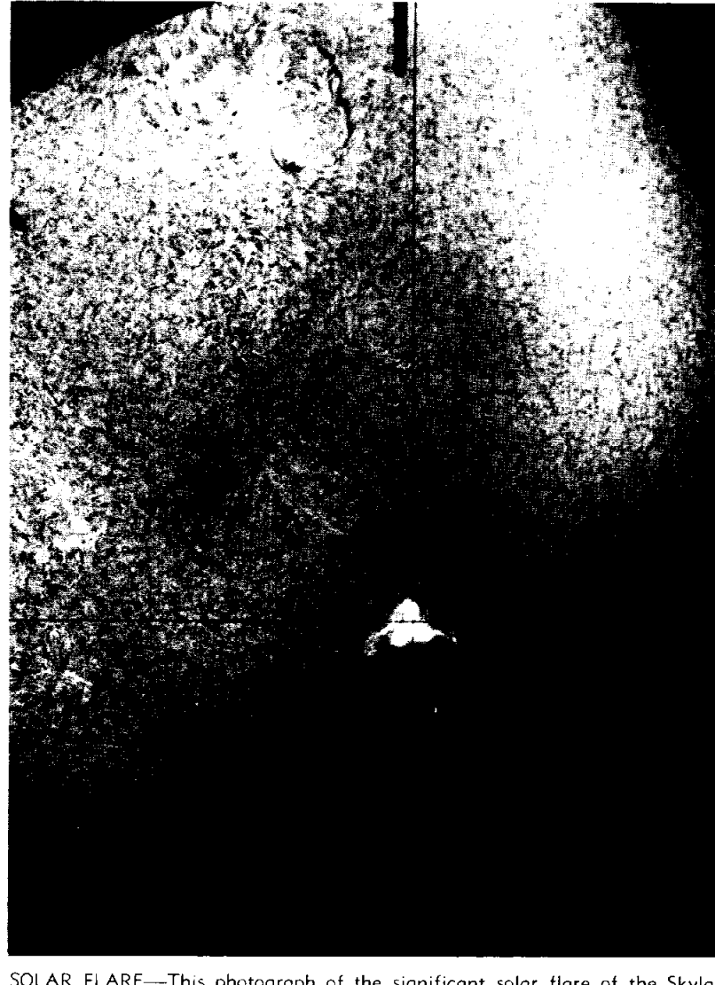
SOLAR FLARE—This photograph of the significant solar flare of the Skylab 2 mission is reproduced from one of the frames of flight film recovered from the Hydrogen Alpha Telescope No. 1. There are two Ha telescopes on ATM which are used by the astronauts to guide the main ultraviolet and X-ray telescopes to precise targets on the sun. One of these telescopes (#1) provides a photographic record of the solar disc at the exact times of ATM experiments for later data analysis. Both telescopes provide TV displays of the sun to the astronauts on board Skylab. Both telescopes have zoom capability from approximately full sun images to a field of view of 4.5 arc min. The cross hairs are accurately aligned to the HCO and NRL instruments by the astronaut using the sharp limb of the sun, and indicate where those instruments were located during the flare data taking sequences.

Another experiment using "Mummichog minnows" examines the disorientation of fish when exposed to weightlessness.